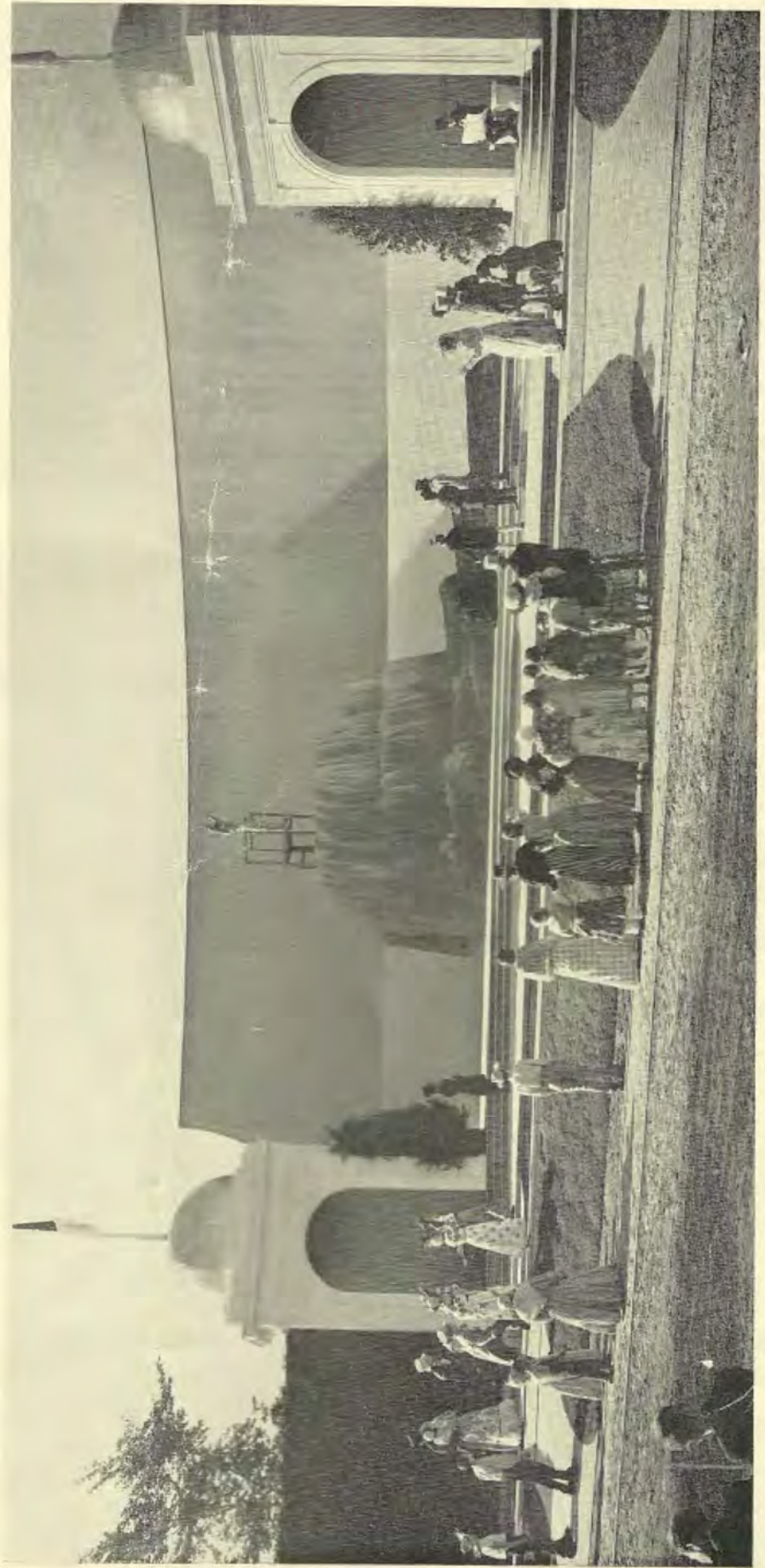
SAM PATCH'S LAST JUMP—SCENE 3