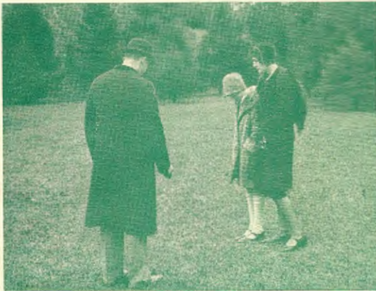
In this Case the Burden was Shifted to Weaker Shoulders.