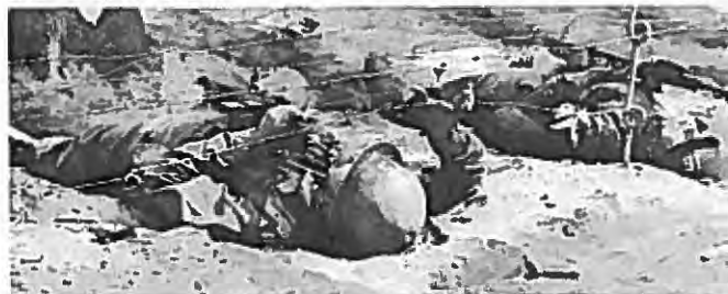
Preparing soldiers for combat — 12,430 per cycle is the mission of the 98th Division.

A further development of the division in the late 1960s and early 1970s was community action. For example, the Engineer Pioneers of the 3rd Brigade helped a Boy Scout troop build a bridge at a Boy Scout camp; the 4th Brigade helped clean up a cemetery in Olean, in conjunction with local veterans groups; and troops from Transportation Company, Support Battalion, used their vehicles to assist Operation Morale, a group sending packages to soldiers in Vietnam, and to cooperate with Monroe County civic groups ecology efforts, including metal can and glass recycling. Such community action efforts are a logical follow-up to the division's goodwill efforts during the floods in Kentucky in the 1940s and community service during the Depression.