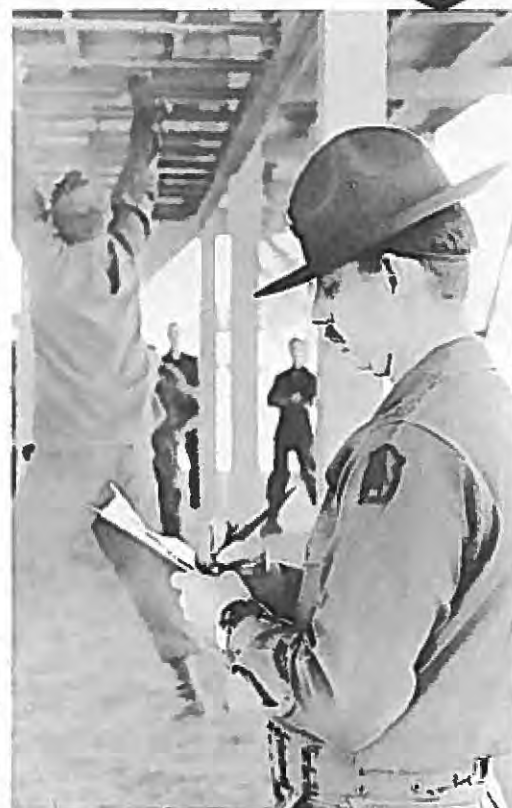
Keeping score during PT (physical training) test.