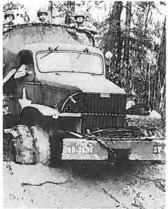
Artillery truck in convoy plows through hub-high mud at Camp Breckinridge, Kentucky, during spring field problem.