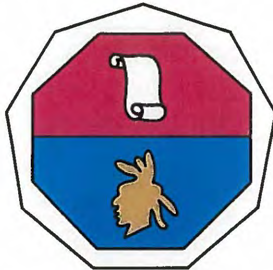
Headquarters 98th Division