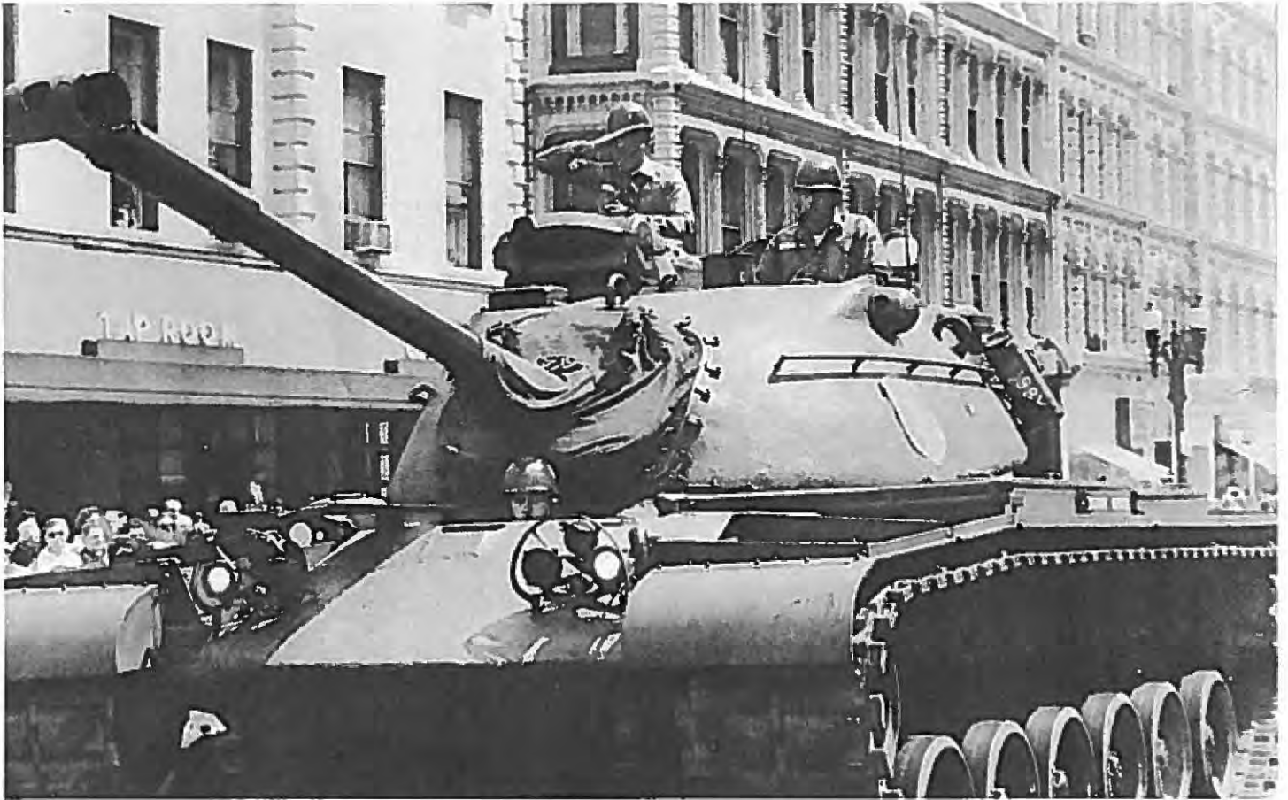
Tank rolls down Main Street, Rochester, during Memorial Day parade in the Fifties.