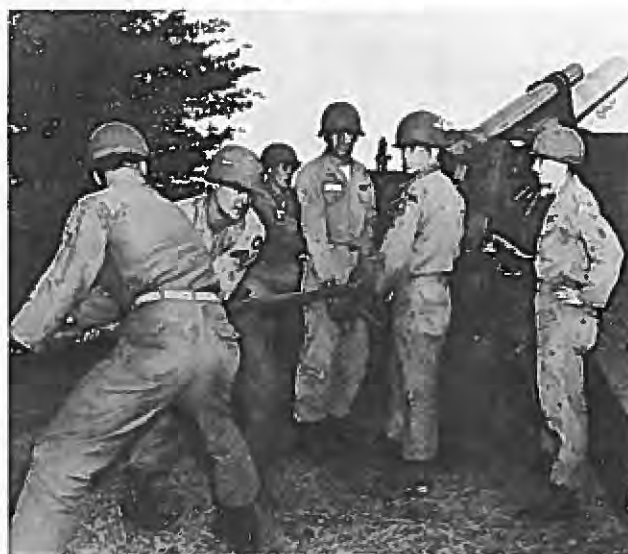
Artillery crew at work.

The 98th Infantry Division annually demonstrated its combat readiness in field training exercises at Camp Drum, New York. In addition, the division's command echelons exhibited ability to react with decisiveness in simulated invasions of Europe. These map exercises, like "Exercise Raindrop II" in 1956, emphasized the "One Army" concept by combining elements of the active Army, Reserve and National Guard.