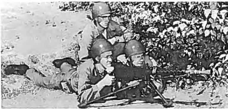
Machine gun training.

"In these uncertain days sometimes referred to as an uneasy Armistice, when our leaders are urging that America be kept strong and ready, the reorganization of our reserve divisions is of vital importance to the country. . . . It is a continuously strong America which can make enduring peace."