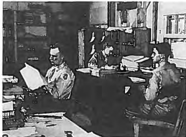
Paperwork played a big role in preparedness—these men in the adjutant general's department at division headquarters.

Meanwhile, on Hawaii, readiness training continued. Ultimately, however, the combat destiny of the division was not to be influenced by its scores on debarkation tests, but by an Army Air Force unit on the island of Tinian. The crew and weaponry aboard a B-29 bomber named Enola Gay cancelled the 98th Division's combat role. The aftermath of the Hiroshima and Nagasaki bombings changed the situation in the Pacific radically. The Japanese people, imbued with the traditions of bushido and hari-kari, who were expected to fight to the death, were confused and unnerved by the unprecedented mass destruction. Japan capitulated.