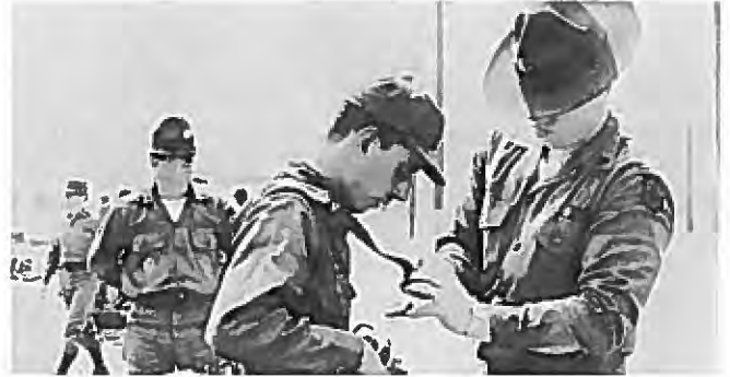
Drill Sergeant assists basic trainee with equipment.

COMMUNITY SERVICE: Being part of the community, and taking an active role in the happenings of the community, is another aspect of the citizen-soldier of the 98th Division.