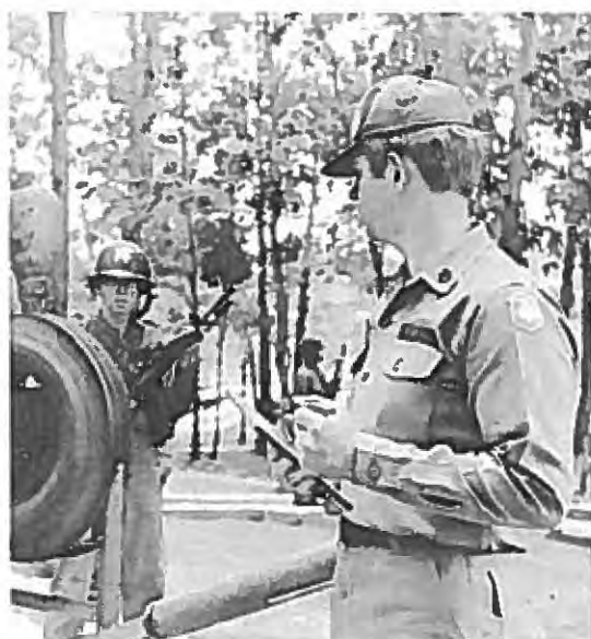
Tester at Proficiency Park, testing site at the end of 8-week basic training.