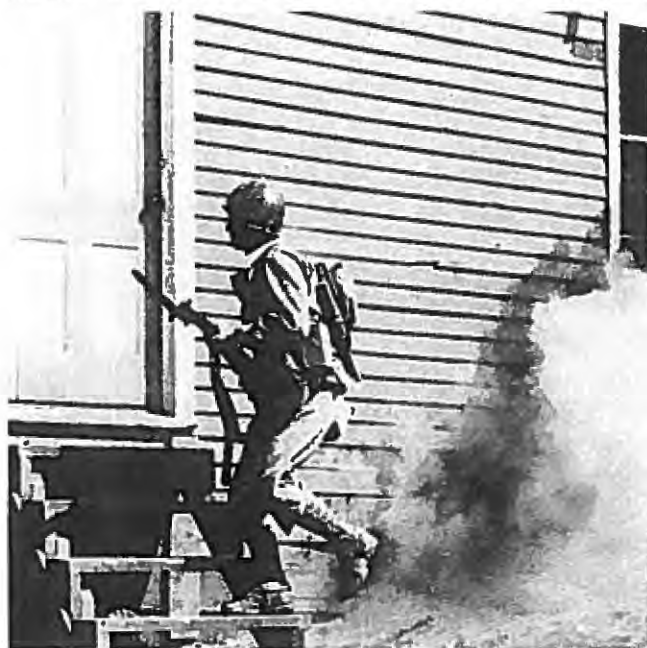
Training in how to capture a village is provided by simulated "Nazi Village." This soldier is two steps ahead of an exploding mine.

As the Pacific fleet and MacArthur's ground forces moved closer to the island empire, War Department strategists turned to planning the invasion of Japan. If they had any doubts as to the ferocity of the Japanese response to such a campaign, the kamikaze pilots and suicide infantry