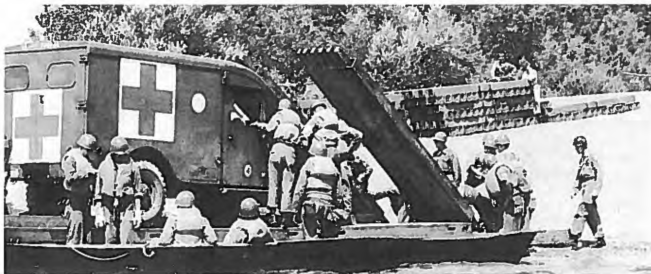
Iroquois engineers at work during annual training at Camp Drum.