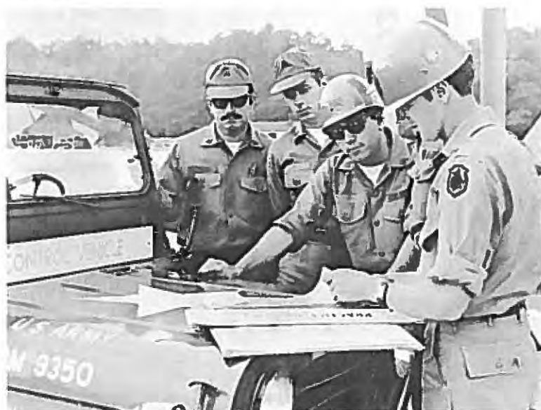
Drivers training at Fort Dix, one of the seven CST specialties.