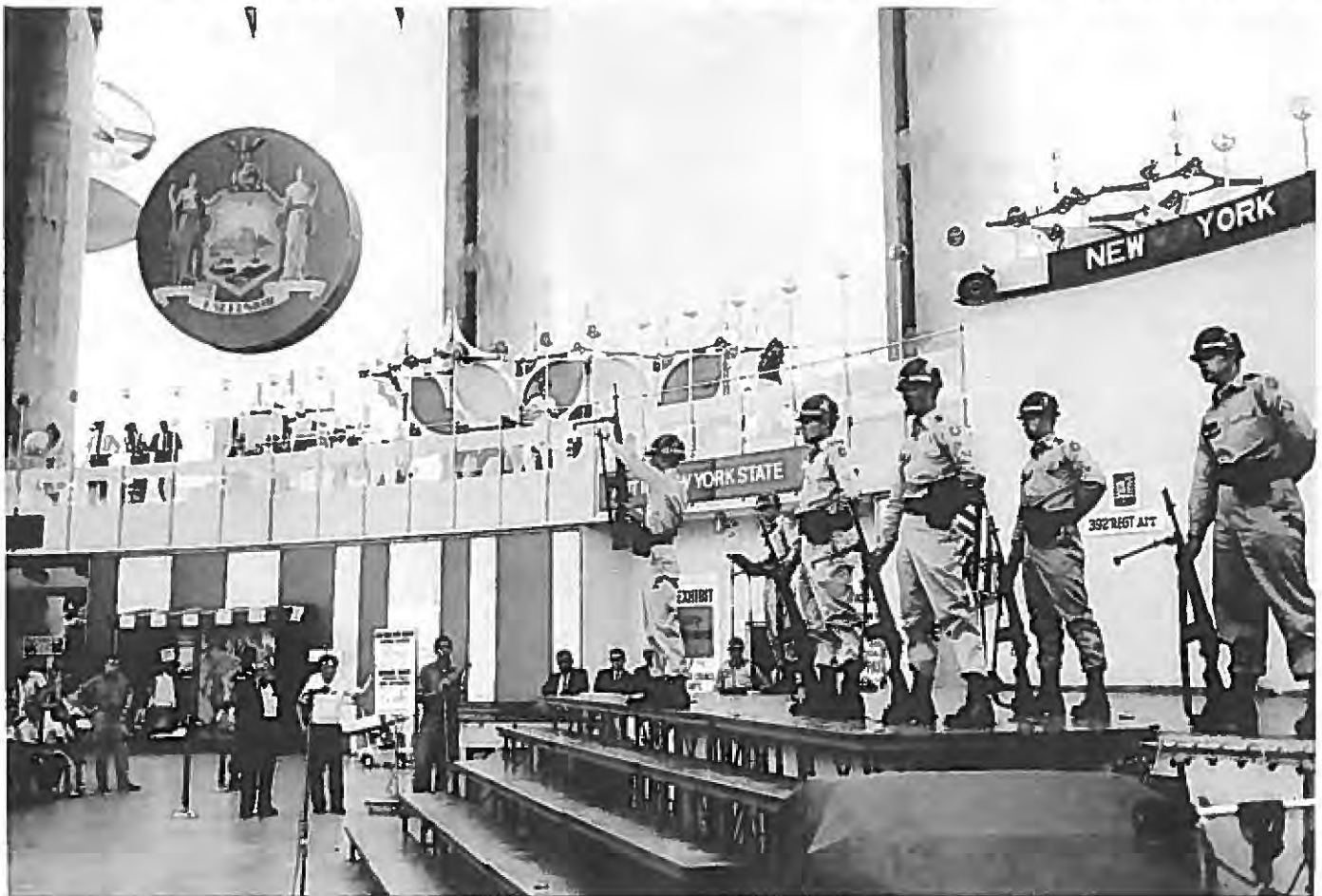
Demonstrators from 392nd Regiment (AIT) at New York State Pavilion at World's Fair (1964).

Perhaps the most dramatic innovation of the period was the Drill Sergeant concept. With the