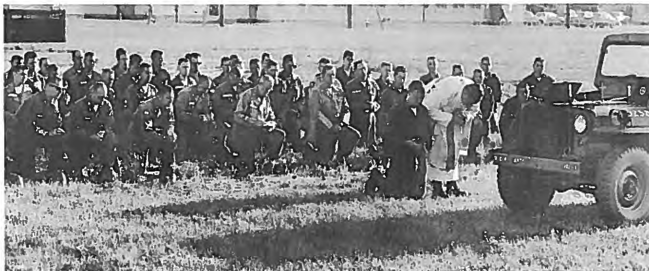
Field Mass for officers and enlisted men at Camp Drum.