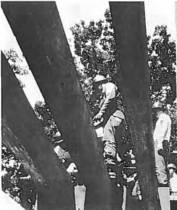
Engineer "Pioneers" of the 3rd Brigade build a bridge.