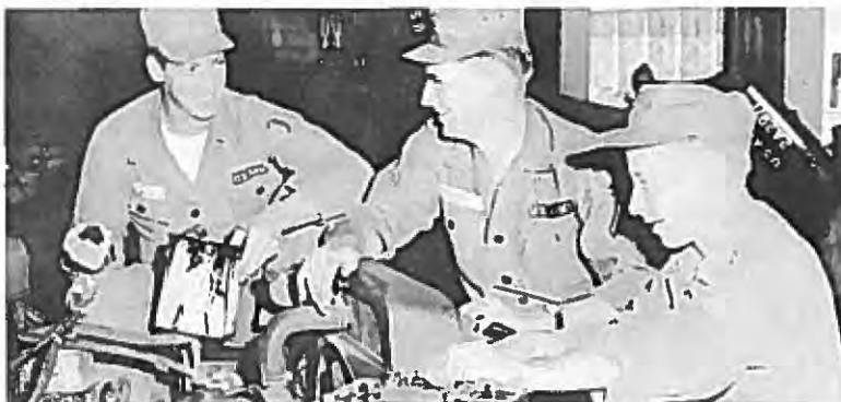
Mechanics in motor pool.

The Rochester Democrat & Chronicle trumpeted the challenge: