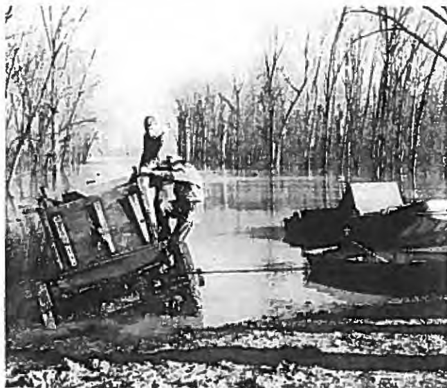
Amphibious jeeps' versatility proved helpful in rescue work in Kentucky.

After unit training, the division moved to Tennessee for combat maneuvers and from there to Camp Rucker, Alabama. By the time of arrival at Rucker the division had passed its readiness test, and had turned its attention to refresher training. Then came the wait for deployment.