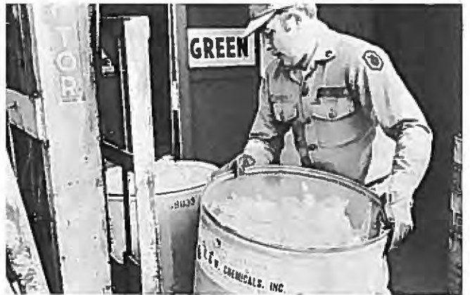
Reservists in Rochester cooperate with ecology groups in recycling cans and bottles.