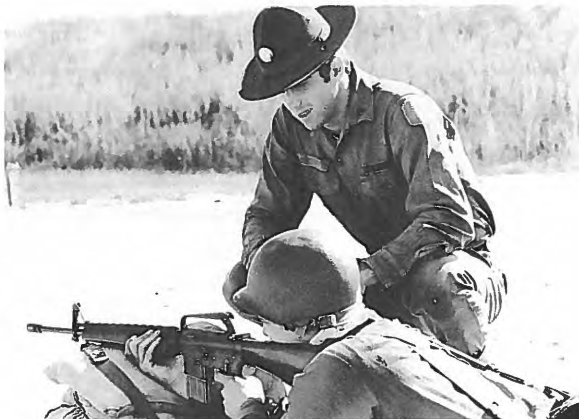
Iroquois Drill Sergeant helps a trainee on the rifle range during annual training at Fort Dix, 1970.

Drill Sergeant, the professionalization of the training mission reached a new high. The Drill Sergeant program was conceived to achieve high quality training and to give added recognition and status to the basic training instructor. The first class of 98th Division Drill Sergeants was graduated from the Fort Dix Drill Sergeant School in 1967. Today there are 411 Drill Sergeants in the division.