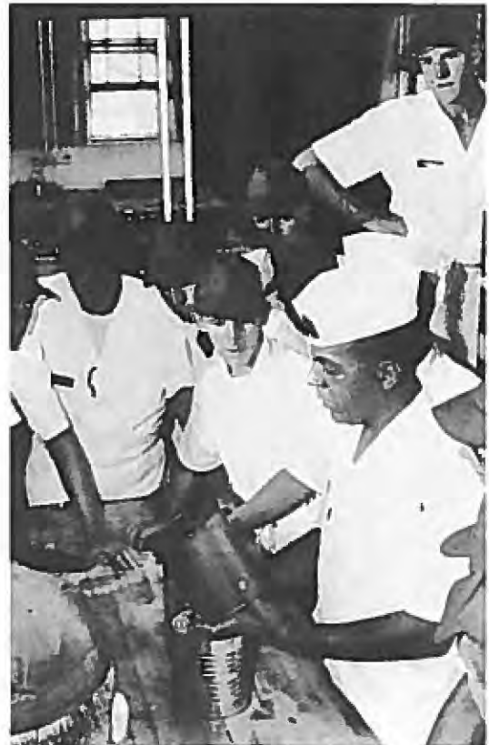
Bakers school at Fort Dix.