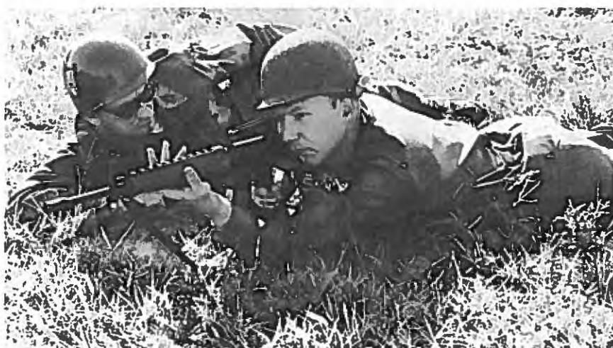
Sergeant coaches during M-16 training at Fort Dix.