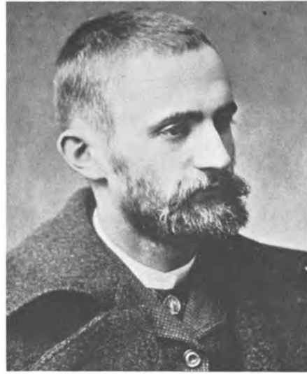
In 1882 when this photograph was taken Eastman was 28 and working vigorously to build his infant company.