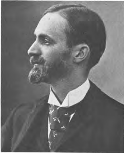
Nadar, famous portrait photographer and an Eastman dealer, photographed Eastman in Paris when the latter toured Europe in 1890.