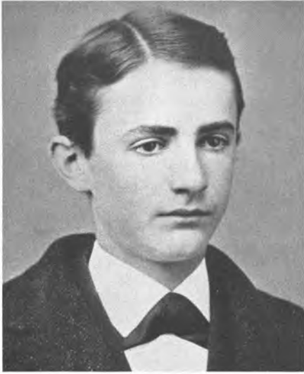
George Eastman as a youth. At 13 he went to work as a messenger in a Rochester insurance office. Later he entered banking.