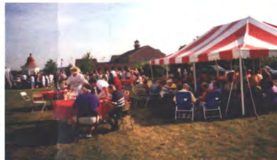
The Strawberry Festival moves to the grounds of the Greece Historical Society's new home.