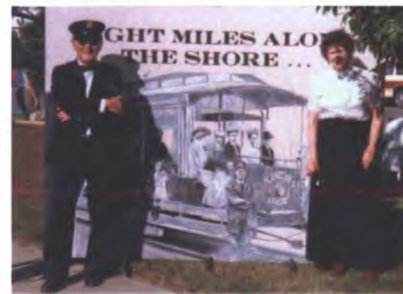
GHS publishes an Illustrated History of Greece, N.Y. ... Eight Miles Along the Shore in 1982.