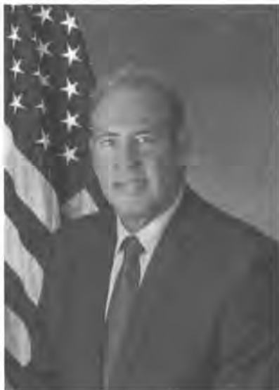
Senator Joe Robach