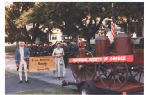
GHS members participate in the 1985 Barnard parade.