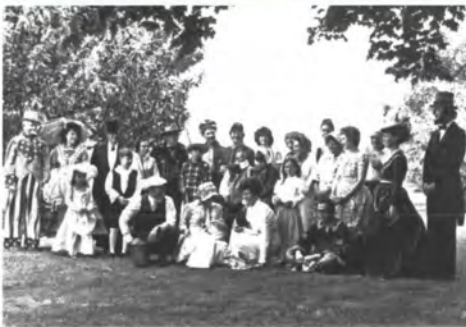
Members of the Historical Society of Greece, N.Y. costumed to march in the Barnard Parade, July 1973.