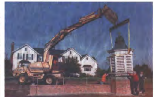
The Greece Memorial Town Hall cupola is incorporated into the Society and Museum's new sign.