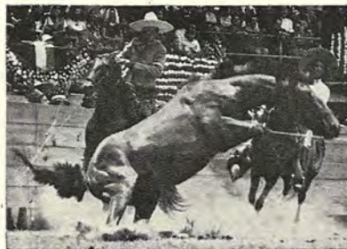
GRAFLEXED BY KIP ROSS—BOUGHT BY LIFE