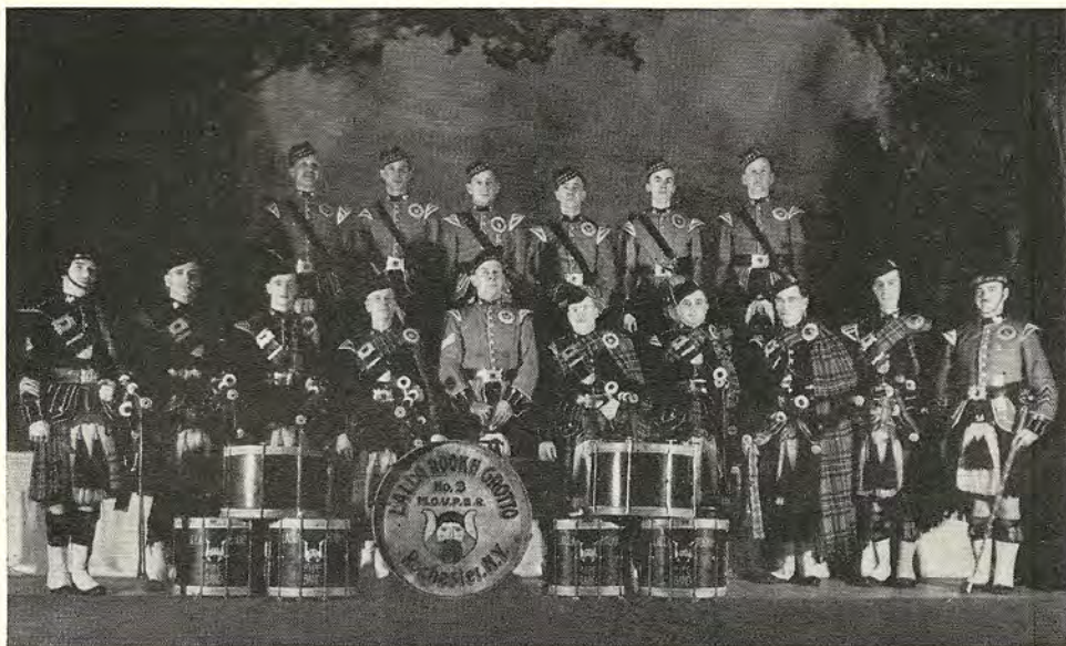
LALLA ROOKH GROTTA PIPE BAND

36 ST. PAUL STREET • • ROCHESTER, NEW YORK