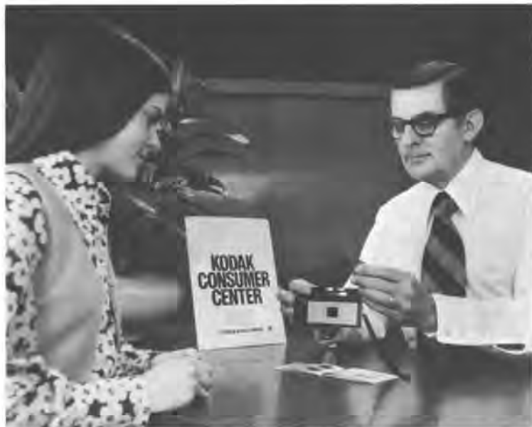
A Kodak customer gets advice on picture-taking at one of the 45 Kodak Consumer Centers across the United States.