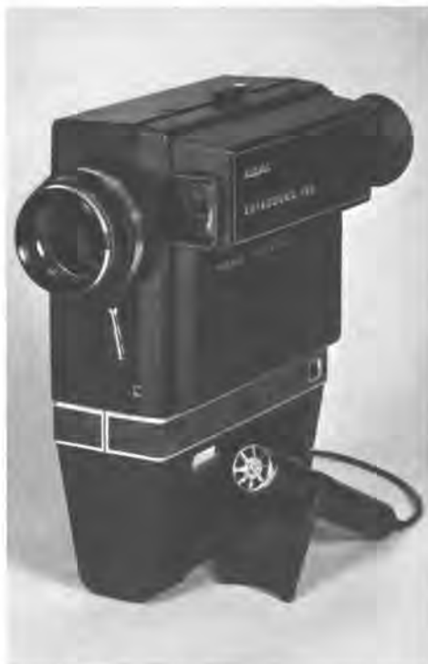
Two recently introduced home movie products are the Kodak Ektasound 245 movie projector and the Kodak Ektasound 150 movie camera with automatic lip synchronization.

tor adds sound recording capability to the above basic features. In addition to the ability to record sound tracks, the unit can add sound on sound or erase portions of prerecorded material.