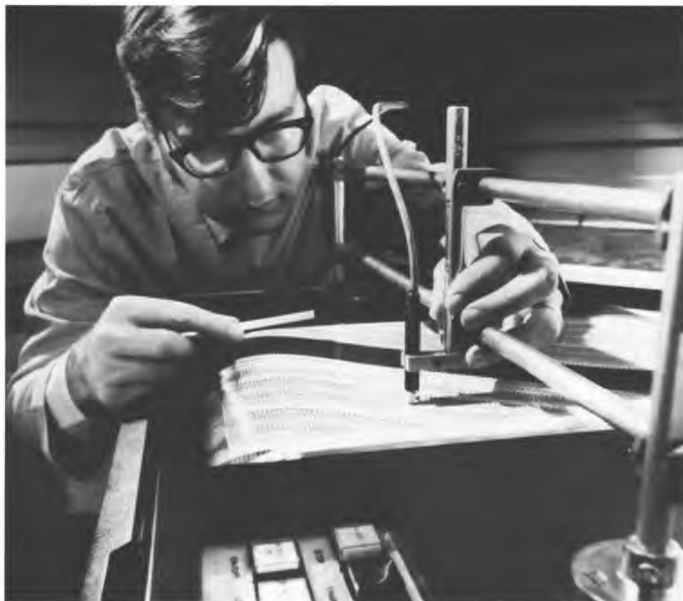
A Kodak research scientist measures characteristics of the company's new dielectric film.