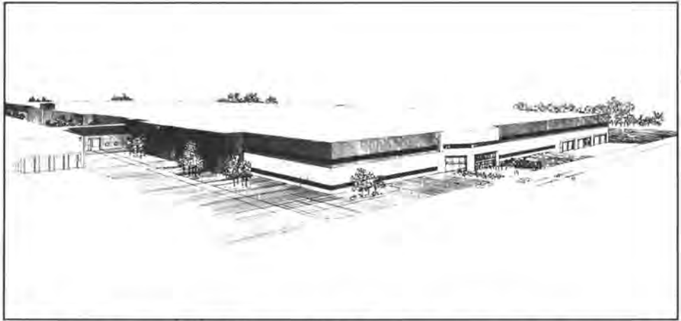
Architect's drawing of 600,000-square-foot building now under construction at Kodak Apparatus Division's Elmgrove Plant in Rochester. The new facility is intended to be used for the manufacture of Ektaprint copier-duplicators.