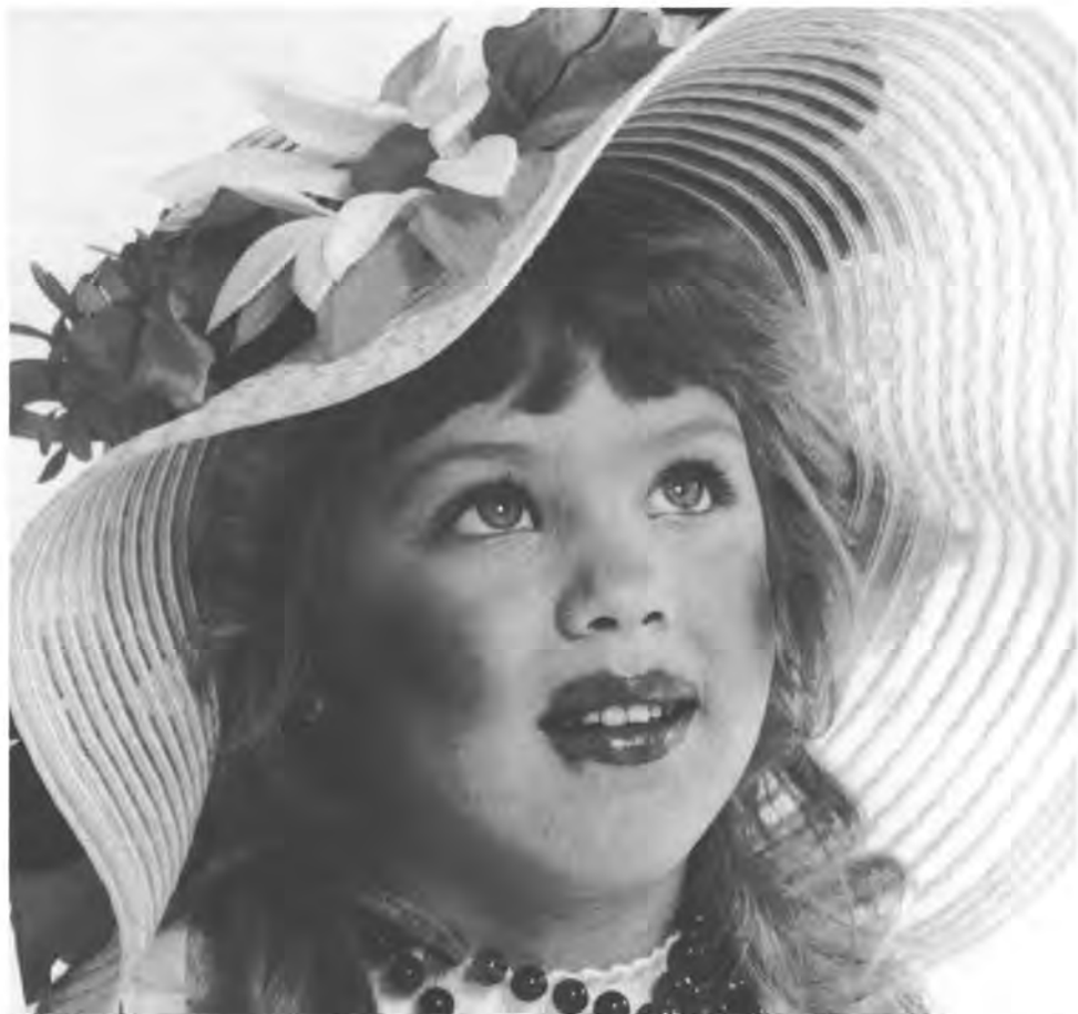
This black-and-white photograph was printed from a color picture taken with new Kodacolor VR 200 film.