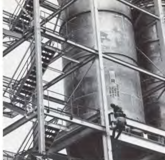
A plant for the expanded production of polyethylene is scheduled for completion in 1983 at Texas Eastman Company.