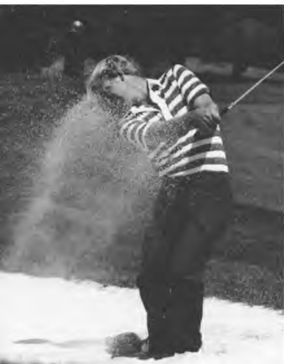
The sailboat photograph above was printed from a color picture taken with Kodacolor VR 400 film, and the golf picture below was printed from an original color photo taken with Kodacolor VR 1000 film.

exposure errors or if the scene contains both brightly lighted and dark subjects."