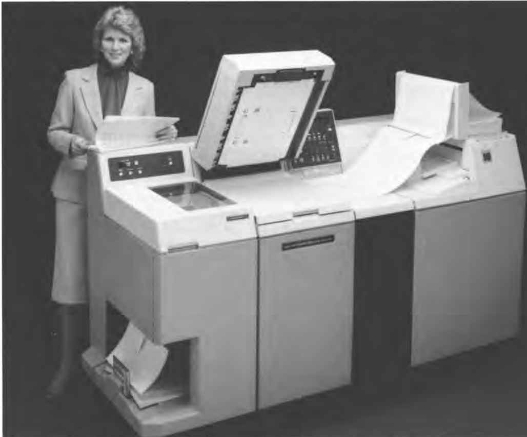
The new Ektaprint 200AF copier-duplicator and Ektaprint continuous forms feeder can copy lengthy, continuous computer forms at the rate of 4,200 images per hour.

Improved image quality stems from refine-