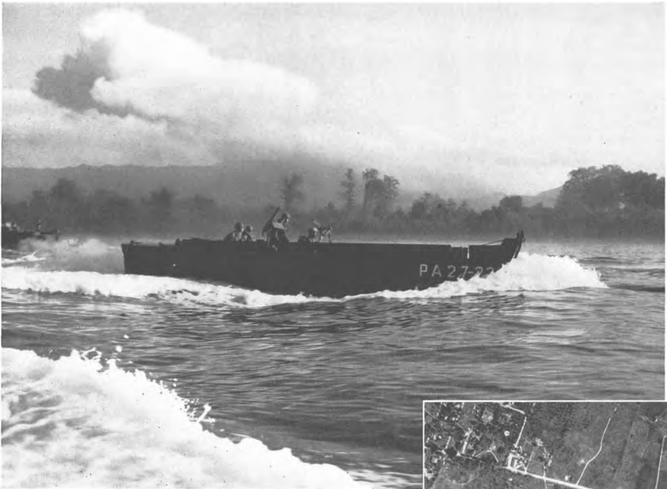
Above: The essence of invasion, the swiftness and stealth of an early-morning attack in the tropics, marks this dramatic photograph of Marines going in for their landing on Empress Augusta Bay, Bougainville.