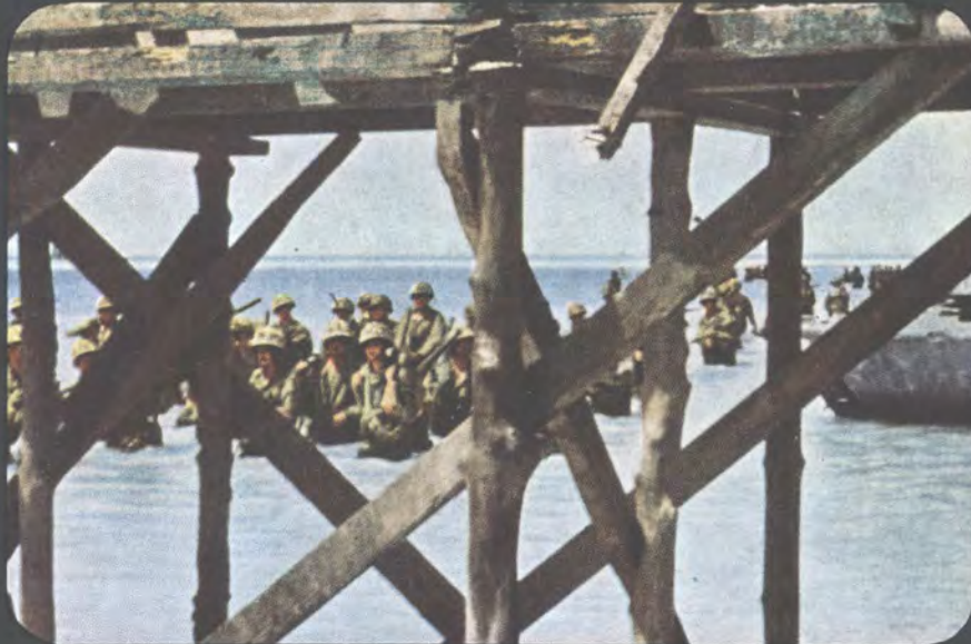
Kodachrome motion-picture scenes from Tarawa. With a foothold on the beach already gained, Marine reinforcements are seen wading ashore toward a pier.