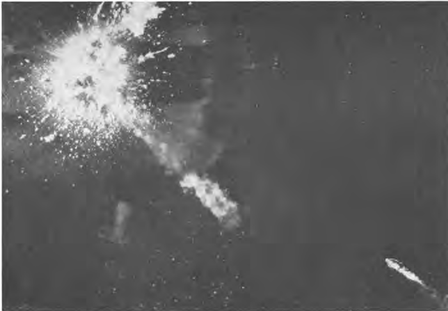
2. Bombs away! They strike the larger vessel, which explodes . . .

operation by the Camera Works. A large number of new employees are being added by the Company for work in this building.