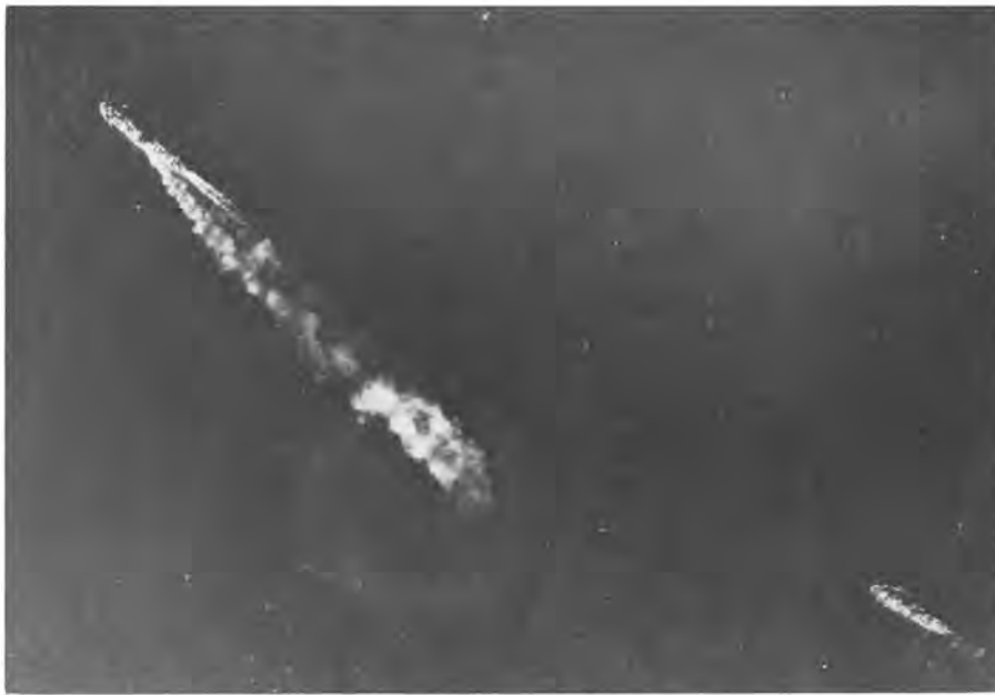
1. Two Axis supply ships are sighted by Flying Fortresses . . .