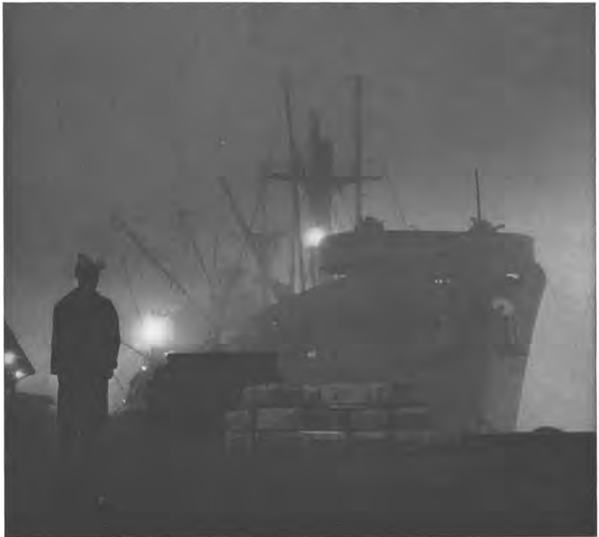
Far from Main Street, U.S.A., this American sailor watched a ship loading in an Australian port . . . and a Navy photographer saw in the scene the possibility of a symbolic and affecting picture

To provide increased capacity for the manufacture of fire-control instruments for the Navy, a seven-story building in the center of Rochester was acquired by that service late in 1943 and is being remodeled for