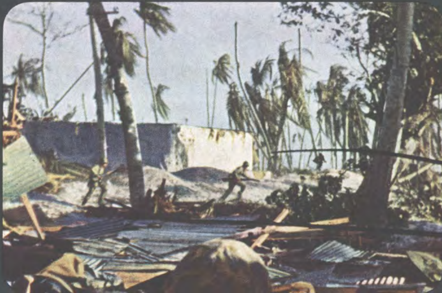
Three Marines on the attack may be discerned passing a Japanese blockhouse. . . . Action films in 16-mm. Kodachrome by the Signal Corps, the Navy, and the Marine Corps have been enlarged to theater size for nationwide projection.