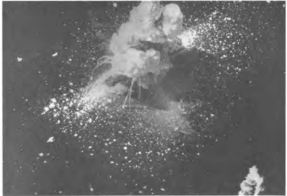
3. Then comes the smaller ship's turn. Another direct hit . . .

Basic assumptions have been made as to the postwar level of general business and the Company's postwar volume of sales; and they have served as a foundation for estimates of the postwar needs for employment and new capital equipment. Prospective changes in Company organization to meet the anticipated conditions are being given attention, with special regard for such matters as placement of employees returning from service, development of new products, and research in sales and distribution. Study is being applied to utilization of plant facilities,