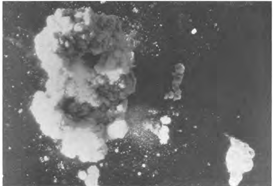
4. Thus ends the usefulness of many tons of enemy ammunition

simplification and improvement of operating methods, and factory reconversion.