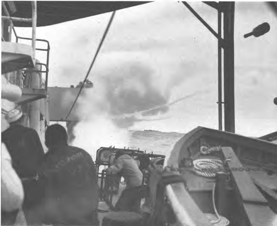
A cameraman on the Spencer caught the firing of a depth charge, first blow in a battle that ended in victory for the cutter over the submarine. Ships of the Spencer's convoy may be seen in the distance