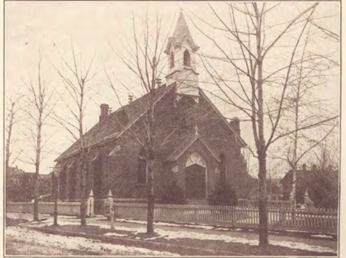
THE OLD CHAPEL Erected 1865