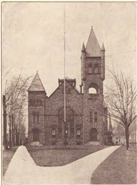
THE OLD CHURCH Dedicated February 10, 1891