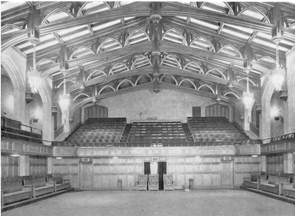
CATHEDRAL HALL—LOOKING TOWARD BALCONY