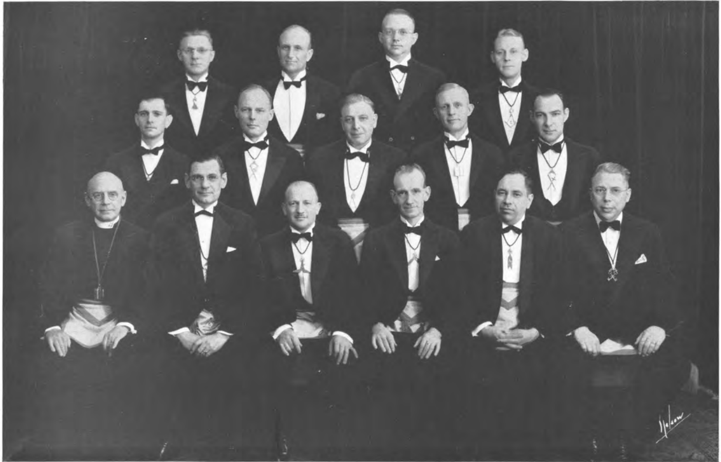
OFFICERS OF ANCIENT CRAFT LODGE NO. 943, F. & A. M. 1937