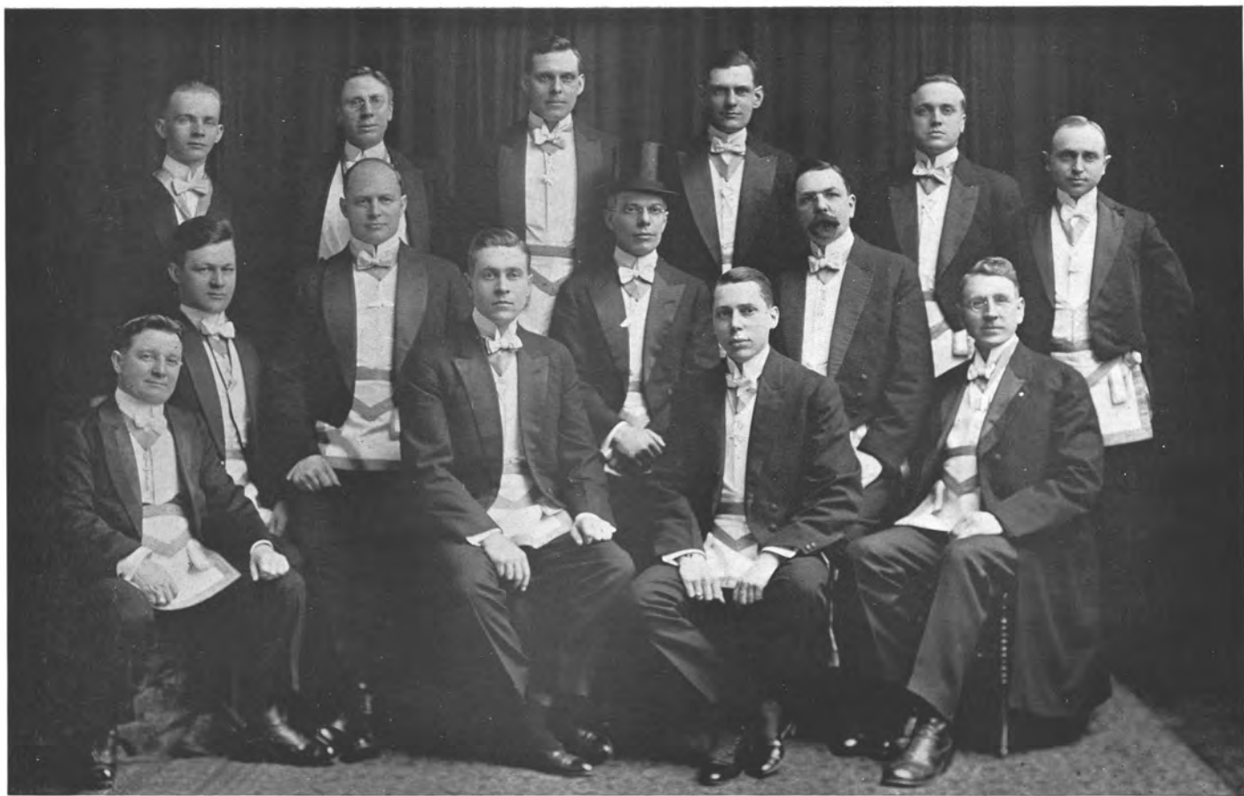
OFFICERS OF ANCIENT CRAFT LODGE 1916-1917