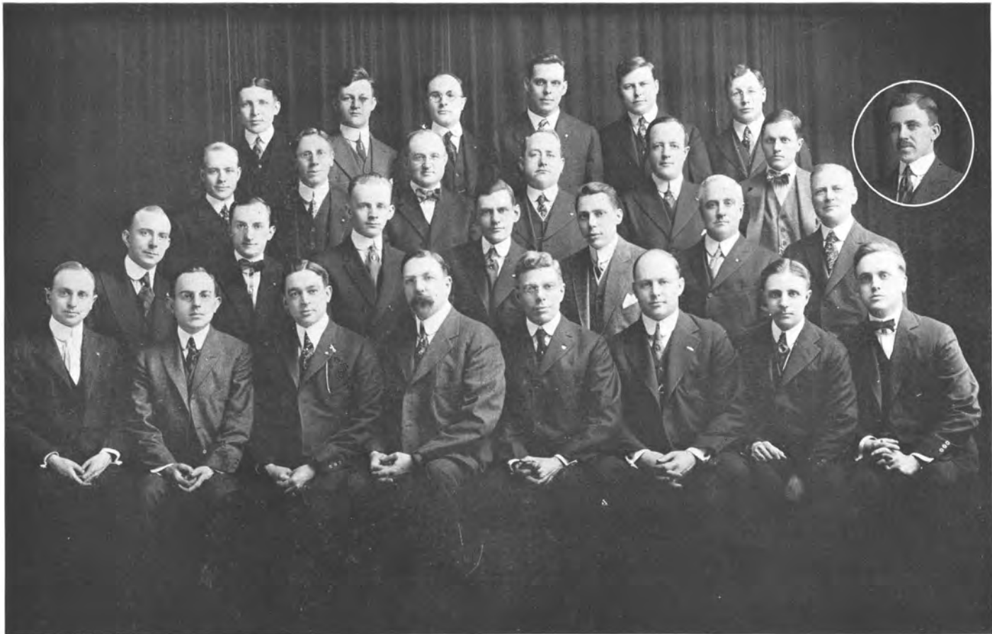
CHARTER MEMBERS OF ANCIENT CRAFT LODGE NO. 943, F. & A. M.