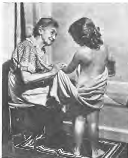
"Granny, I Love My Hot Bath."

Unless you have an automatic heater you do not have real hot water service. You have merely a partial service. You have to wait for water to heat and often have to trot up and down stairs to turn an old-