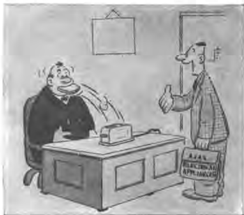
"With this one you don't even have to reach for the toast." ( Electrical Merchandising )

Twenty-one cents out of every dollar taken in by the R. G. & E. last year was paid out in taxes. The Company's total tax bill for 1940 was $3,620,775. This item is one that is usually ignored by proponents of public ownership when they compare Rochester with cities which may have lower electric rates but which pay very little in taxes. Most of these cities would have higher rates than Rochester if their power systems were taxed on the same basis.