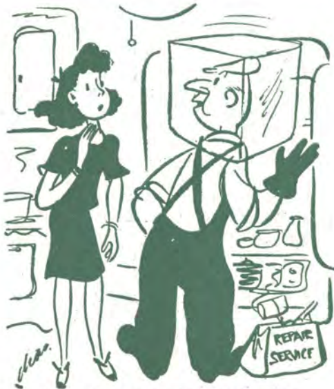
"I caught my head in the freezing compartment!"

When you ask any woman her age, It's like buying a second-hand car, You know the mileage's been set back But it's hard to tell how far.