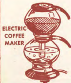
ELECTRIC COFFEE MAKER