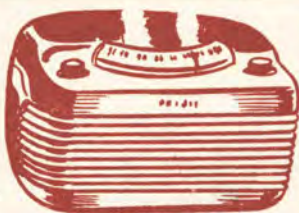
TABLE MODEL RADIO