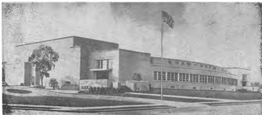
ROCHESTER RADIO CITY