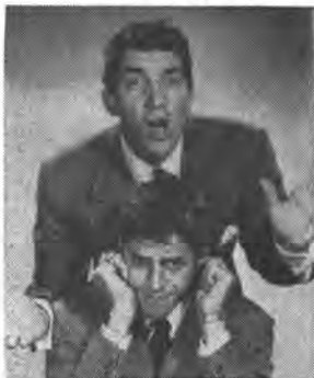
MARTIN & LEWIS

No matter. You'll still be as thrilled as the first time you saw television when you catch the wonderful