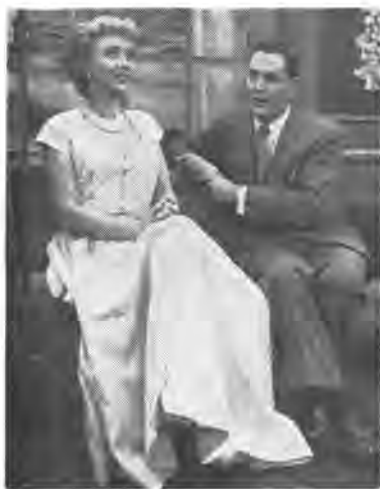
Celeste Holm — Dan Seymour

Justice Douglas appeared as the key figure in a spy ring, imagined by the Soviet government, and acted the part of a mysterious agent called "X".