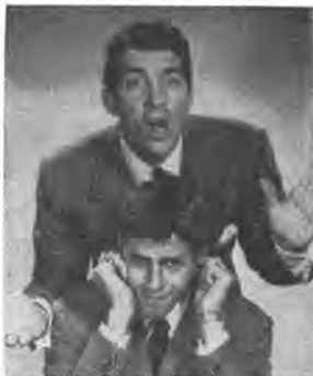
MARTIN & LEWIS

No matter. You'll still be as thrilled as the first time you saw television when you catch the wonderful