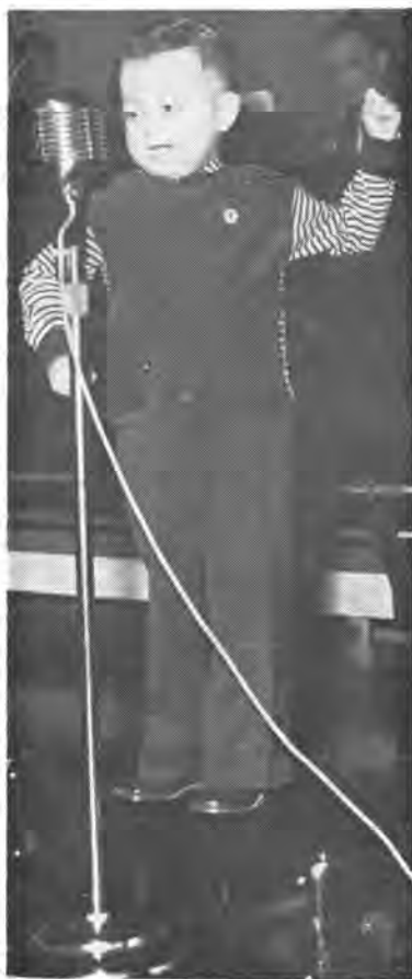
"Personality . . . Ph. D."