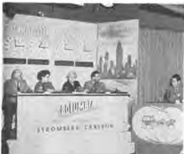
Round One! Who will win the free trip to New York City

The program, of course: " Cinderella Weekend ."