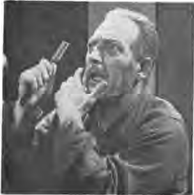
Everett Sloane as "Vincent Van Gogh"

One of the most famous of those biographies was " The Life of Vincent Van Gogh ", last November, starring Everett Sloan seen here as the famed painter.