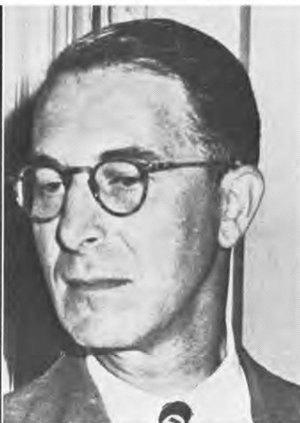
Senator Estes Kefauver (D., Tenn.), right, heads up Senate Crime Committee currently probing big-time gambling in U. S. Sen. Charles Tobey (R., N. H.), left, committee's "sledge-hammer diplomat," made colorful viewing during N. Y. hearings.