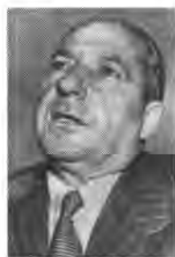
The heat's onl Kingpin gambler Frank Costello sweats out a committee question.

in "Murder, Inc." togged himself out in a new suit every day he appeared.