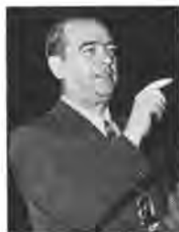
Camera-conscious Ambassador Wm. O'Dwyer turns his best profile to the audience.

Colorful sidelights were injected by Senator Charles Tobey of New Hampshire who appeared at one point wearing a green eye visor to protect his eyes from the glaring Klieg lights. Costello, fastidious dresser and alleged accomplice