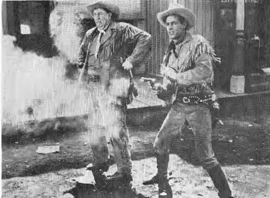
FRONTIER JUSTICE! — Guns blaze and bullets fly as television's "Wild Bill Hickok" (Guy Madison, right) and his deputy, Jingles (Andy Devine), defend the peace of a frontier town in an episode out of the life of America's greatest western peace officer.