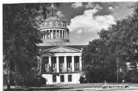
University of Rochester