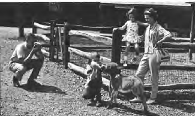
NEW 140-ACRE Lollypop Farm is eight miles east of Rochester, on the Victor Road off Route 31. Here youngsters may pet and feed deer, llamas and other four-footed friends.

Community Playhouse—South Clinton at Meigs. Six professionally directed plays running nightly for two weeks, October thru May. Eastman Theatre—425 Main Street East. World-renowned theatre of the famed Eastman School of Music of The University of Rochester. Concerts and other musical events.