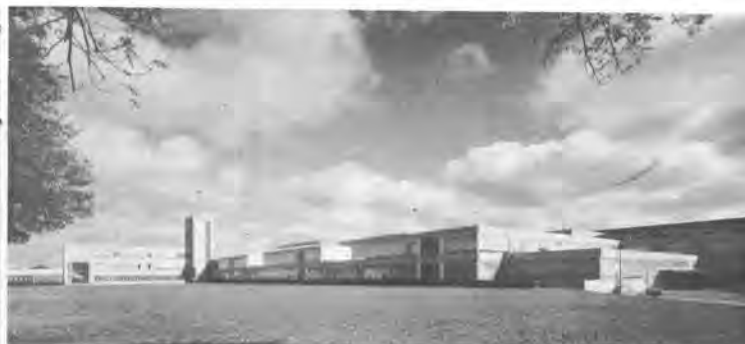
THE ELECTRONICS DIVISION of General Dynamics at 1400 Goodman St. North produces communications equipment and systems. Applied research is also carried on here.

Dollinger Corporation — 11 Centre Park. Filters.