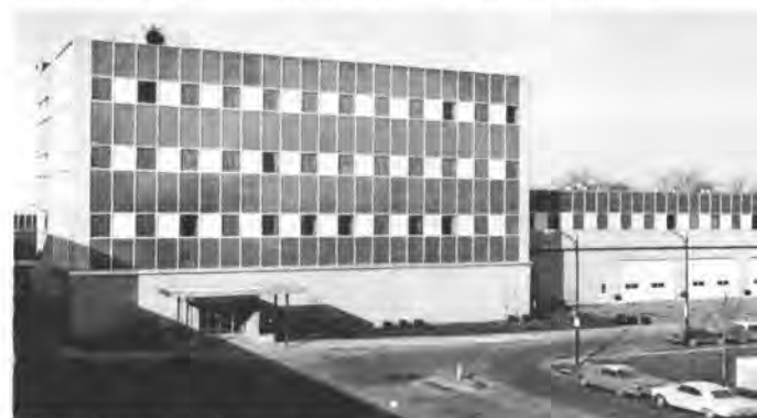
1 MUSTARD STREET is the address, appropriately enough, of the new R. T. French Company plant. Here mustard spices, pet foods and other famous French products are produced.

WSAY —1370 KC—Music-News Station—250 East Ave. Est. 1936.