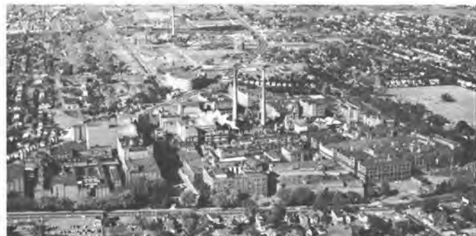
KODAK PARK at 200 Ridge Road West numbers over 200 buildings and is a 1,000-acre city within a city. Here photographic film, papers and chemicals are produced. Tours daily.

Bell & Howell Company, Rochester Film Division — 1000 Driving Park Avenue. Microfilm, Graphic Arts and Industrial Films.