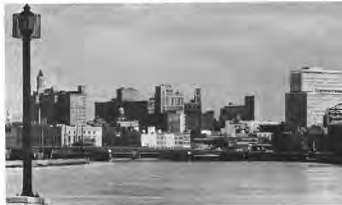
THE GENESSEE RIVER bisects Rochester as it flows north to Lake Ontario. The city's changing skyline shows the new Security Trust Building (right, center) and Midtown Tower.

Security Trust — One East Ave., 103 Main Street East.