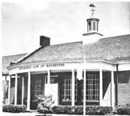
Automobile Club of Rochester in Chestnut Street is one of the finest club headquarters in the U.S.

We have prepared this handy "Buyers' Guide" for your convenience during your visit. In it are listed the points of interest . . . places to stay or see . . . places to shop or dine . . . that we can recommend personally. These fine establishments have shown an active interest in publicizing Rochester and Monroe County and will welcome your patronage. Each cooperates fully with the Convention Bureau to enable you to get the most enjoyment from the area's many attractions.