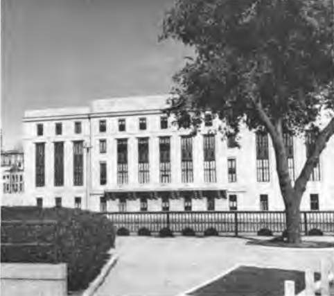
Rochester Public Library at 115 South Ave. has 11 specialized subject divisions, film and record library and art gallery.