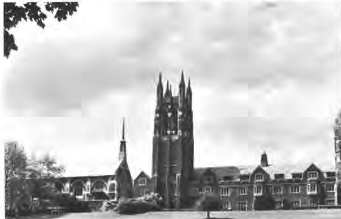
DEDICATED IN 1931 , Colgate Rochester Divinity School stands high on the crest of a hill at Highland Avenue and Goodman Street South. Shown above are its English-Gothic style chapel and main building which are reached by a winding road leading through the scenic slopes of Highland Park.