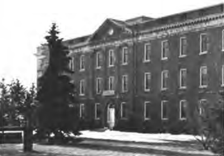
Administrative Office for Monroe County's Parks Department is at 375 Westfall Road.

Published annually by the Rochester/Monroe County Convention and Publicity Bureau, Inc.