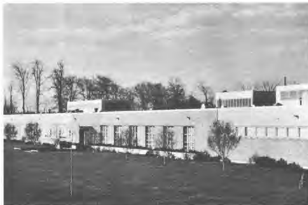
SPACIOUS FACILITIES of Consolidated Vacuum Corporation are on a 53-acre site at 1775 Mt. Read Blvd. High vacuum and environment test equipment is manufactured here.

Bernz-O-matic Corporation — Manufacturers of portable propane torches, campstoves, lanterns, ceramic grills — portable electric refrigerators.