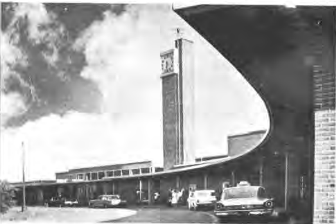
JET SERVICE via American, United and Mohawk airlines is provided by the Rochester-Monroe County Airport which handles over 1,000,000 passengers annually. The expanded facility is 12 minutes by car from downtown Rochester.

Rochester Historical Society —485 East Avenue, houses an extensive collection of historical objects and literary information of this area. Open weekdays 9:45-4:30. Bus 17.