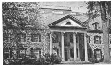
Eastman House of Photography

Rochester's $8,000,000 War Memorial Auditorium, one of the nation's finest convention and trade show centers, is located in the heart of the city.