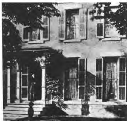
Susan B. Anthony House in Madison Street was the residence of the famous suffrage leader from 1866 to 1905.