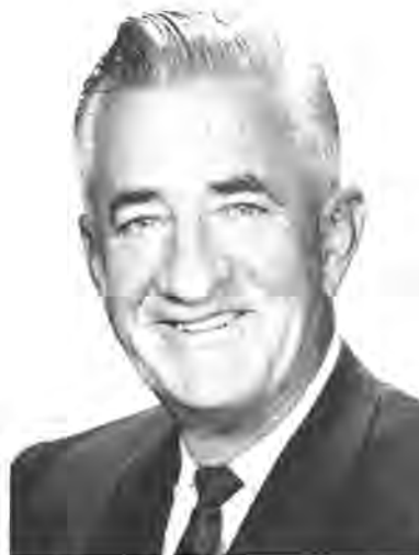
Mayor City of Rochester