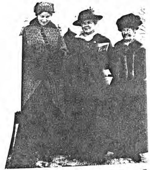
Trolley Stop 20 - Sunday Parnell Road