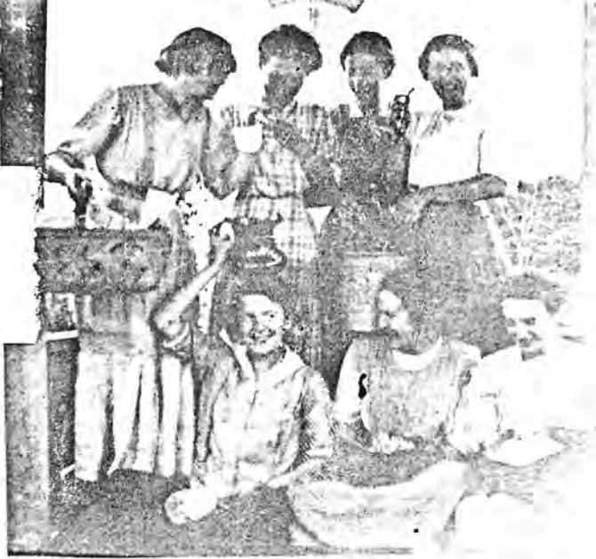
Chimney Bluffs Lake Ontario Co-workers