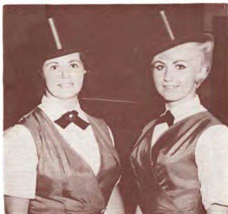
The lovely Coachettes make dining a delight as they serve you at the Coachman Lounge.