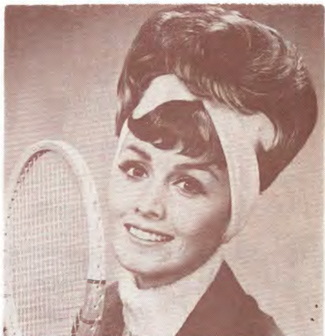
Complete service for all type wigs at the new Rainbow Room of Kay Michael's Wig-Color Salon.