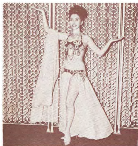
Lovely Belly Dancers are featured at El Marrocco.