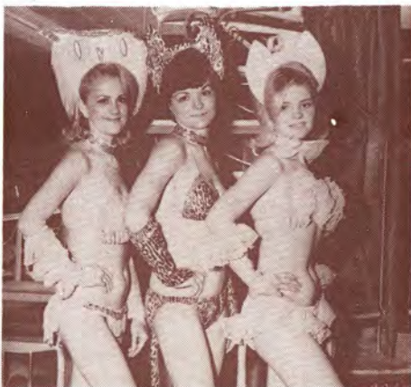
Sugar, spice and everything nice that's what the Rainbow Dancers are at the popular Encore Club.