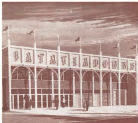
Exciting nite Harness Racina at Batavia Downs.