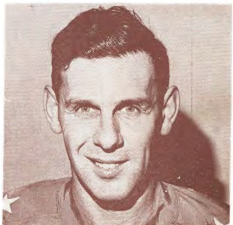
The Rochester American Hockey Team open the season with an exhibition game on Sept. 30.