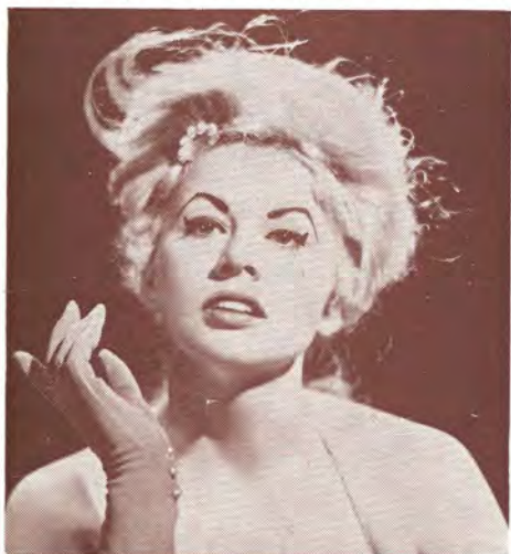
The top stars of the Burlesque world are seen three times nightly at the Bamboo Club.