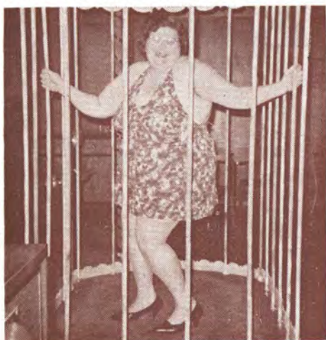
Bubbles Janet continues to set the pace as the biggest attraction in town at Duffy's Tavern.