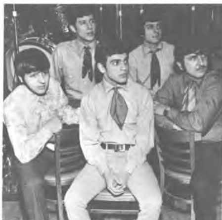
The Fabulous. SCENE