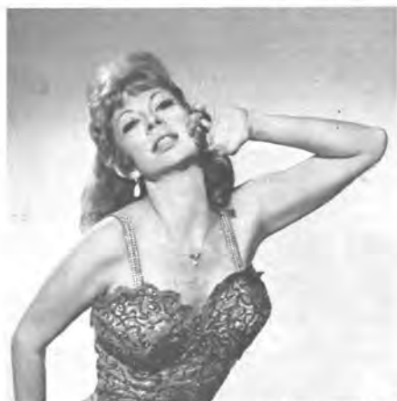
Strippers do their thing nightly at the Bamboo Club on East Avenue.