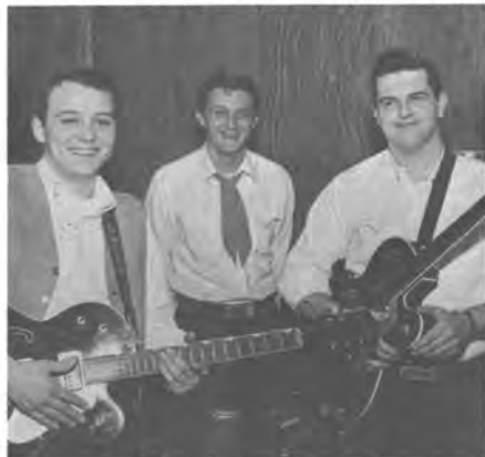
If you like western music, the Coachmen trio are at the Men's Room.