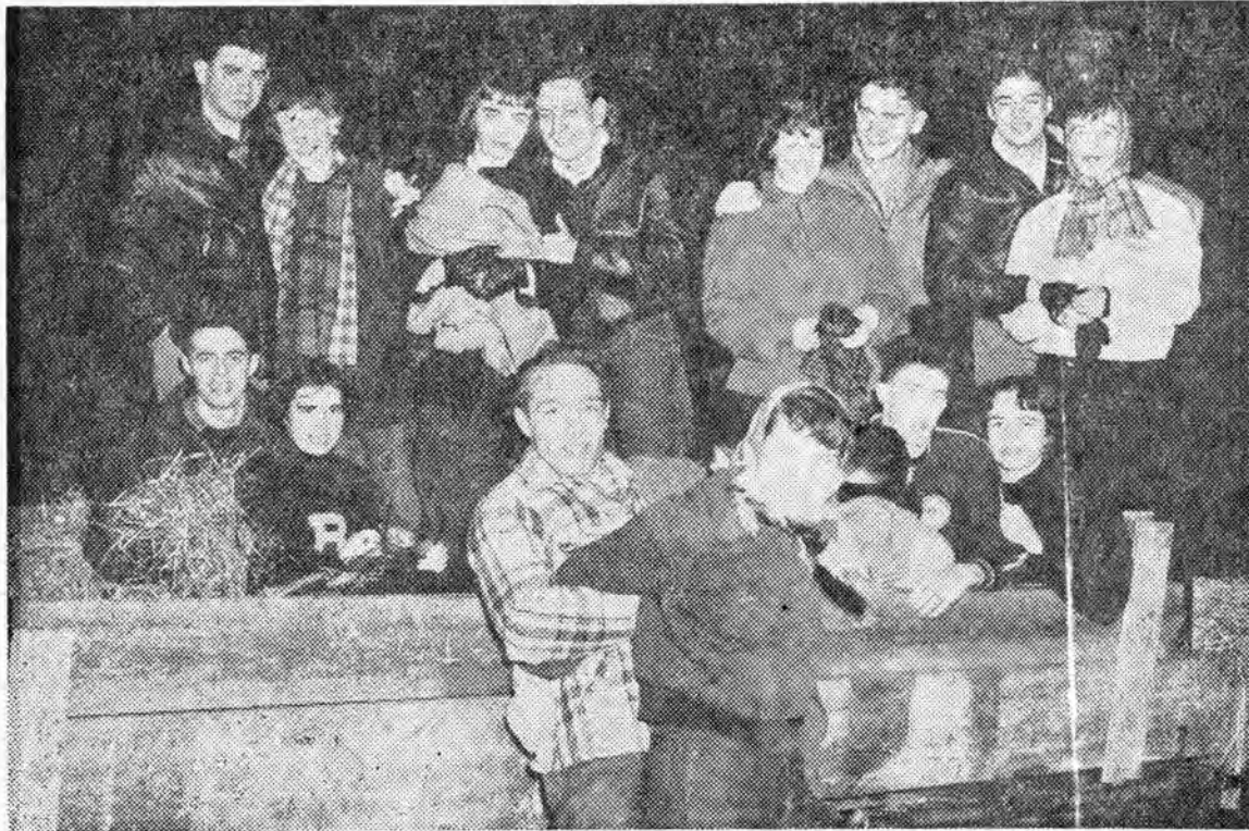
Winter Carnival Hay Ride