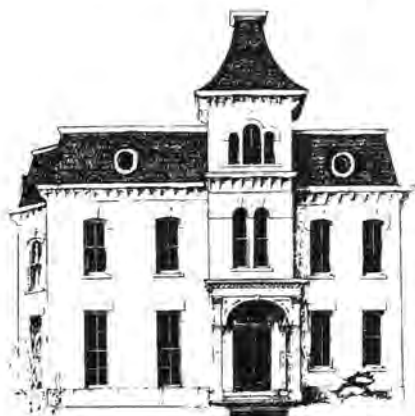
Immaculate Conception Church Convent

The proprietors of Rochesterville offered a lot upon which a church could be built on Fitzhugh, north of what is now Broad Street. The Roman Catholics and Episcopalians both sent emissaries down the river to apply. The Episcopalian rode a faster horse. As a result "St. Luke's Church of Genesee Falls", built in 1817, is Rochester's oldest church building. The First Presbyterian's first building, across the street, was two years older but it burned down in 1817. It was replaced by another building which was given up in 1871 when the old City Hall was erected. The congregation moved to the Spring Street corner of South Plymouth. Their lovely stone building weathered the proximity of the Inner Loop and the new jailhouse, and is now called Central Church of Christ.