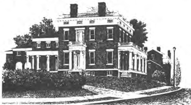
Hoyt-Potter House, 133 South Fitzhugh Street

You are too honest and unsuspecting," didn't endear him to the wily Yankees, either.