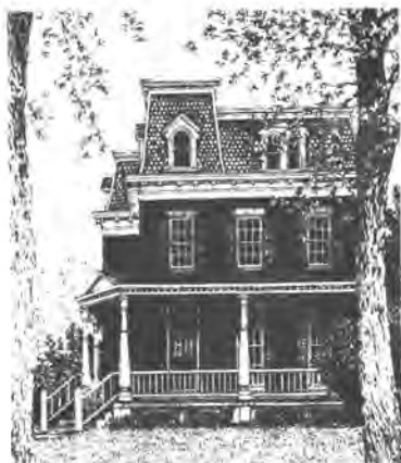
Buell-Button House, Tremont Circle

1950, there were 750 houses built before 1910 in the Third Ward. By 1975, there were only 250 left.