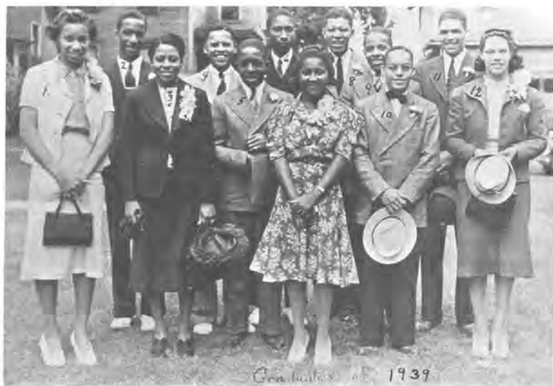
High School Graduates of 1939

The activities geared to provide its youth with socially healthful alternatives appeared to pay off in dividends. At Howard University in Washington, D.C., it was noted that there were about twenty-four young persons enrolled there from the Rochester area in the early 1940's.