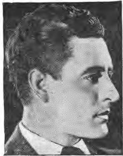
JOHN GILBERT ~ in "La Boheme" at the Eastman Theater all week.