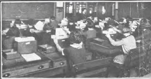
CLASS IN FILING.