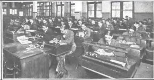
SECTION OF BOOKKEEPING DEPT.