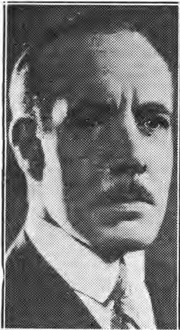
Lewis Stone in "Don Juan's Three Nights" at the Picadilly Theater for four days.

A fascinating widow of Paris and her charming young daughter, who fall in love with a famous musician, a middle-aged bachelor, who has acquired a reputation as a