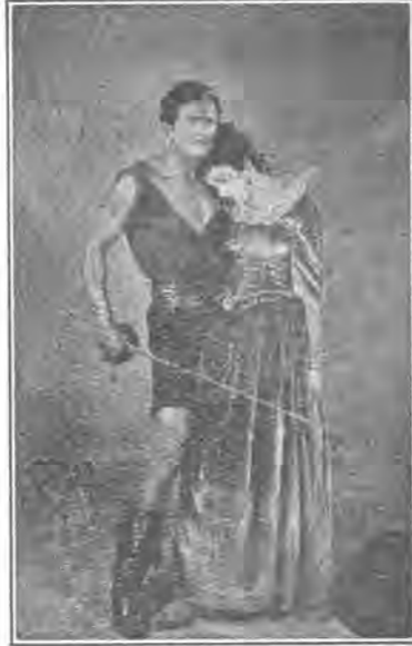
DOUGLAS FAIRBANKS and BILLY DOVE in "Black Pirates" at the Eastman all week