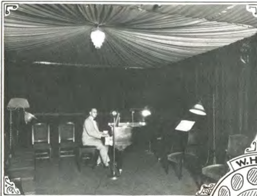
W.H.E.C. Main Studio, Hotel Seneca.