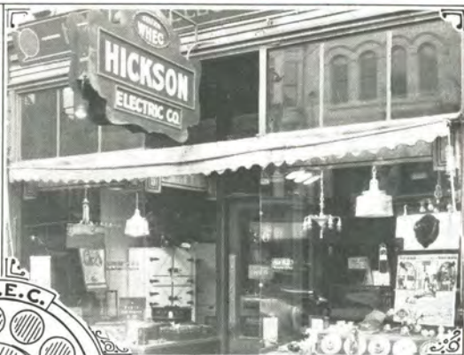
Home of W.H.E.C.