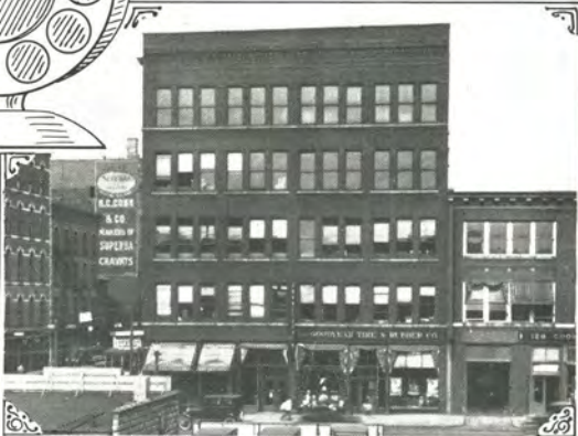
Journal American Building, Home of Rochester Journal Studio.