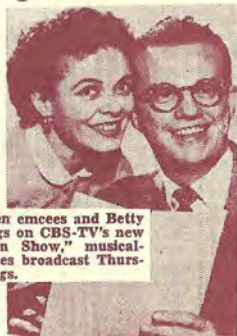
Bill Cullen emcees and Betty Brewer sings on CBS-TV's new "Bill Cullen Show," musical-variety series broadcast Thursday mornings.