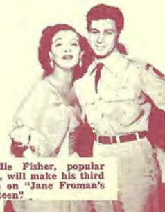
Pfc. Eddie Fisher, popular GI vocalist, will make his third appearance on "Jane Froman's U.S.A. Canteen".