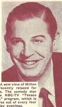
AT EASE —A new view of Milton Berle, who recently relaxed for new portraits. The comedy star headlines the NBC-TV "Texaco Star Theatre," program, which is presented three out of every four Tuesday evenings.