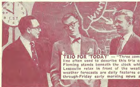
TRIO FOR "TODAY" — "Three commentators, no waiting" is the line often used to describe this trio on the "Today" program. Jim Fleming stands beneath the clock while Dave Garroway and Jack Lescouffe relax in front of the weather map. Time reports and weather forecasts are daily features of "Today," NBC-TV Monday-through-Friday early morning news and special events program.

11:15 8 MTWF-1 IN FAMILY 8 TH-BILL CULLEN 4 TH-YOUR FAMILY 11:30 4 MWF-STRIKE IT RICH 4 TUE-MY BRETHREN 6-8 STRIKE IT RICH 12:00 4 NOONDAY NEWS 5 NOON. PLAYHOUSE 6-8 BRIDE & GROOM 12:15 4-6-8 LOVE OF LIFE 12:30 4 SEARCH FOR T'ROW 6-8 Same 5 M-WIRED WOODSHED 5 TWTF-HEADLINES 12:45 4 GUIDING LIGHT 8 Same 5 H'WOOD MATINEE 6 M-VOICE OF R.I.T. 6 TUE- CROSS TALK 6 W- ART GALLERY 6 TH-HOW YOU DO IT 6 F -MAKE IT, MARKET 1:00 4 MATINEE PLAYHOUSE 6 MTWT-MID-DAY 6 F - BETTY FURNESS 8 TUE-FASHIONS 1:00 8 MWF - ED BROWN 1:15 6 M-YOU & YOUR CHILD 6 F-MIDDAY, MIDWAY 6 TH - TRAVEEERS 1:30 6-8 GARRY MOORE 1:45 4 JOHNNY'S SHOW