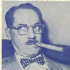
GROUCHO RETURNS —Quiz-and-quiz master Groucho Marx, with his quick ad-libs and unusual interviews with contestants, is back for the third season on the NBC "Groucho Marx—You Bet Your Life" radio and TV show.

7:45 4 NEWS CARAVAN 5-6 Same 8 PERRY COMO 8:00 4 WINCHELL-MAHONEY 5-6 MR. & MRS. NORTH 8 BURNS AND ALLEN 8:30 4 VOICE OF FIRESTONE 5 Same 6 YOU CAN BE A STAR 8 TALENT SCOUTS 9:00 4 I LOVE LUCY 6-8 Same 5 H'WOOD OPENING 9:30 4 MARCH OF TIME 5 ROB'T. MONTGOMERY 6 HEART OF THE CITY 8 RED BUTTONS 10:00 4 STUDIO ONE 6-8 Same 10:30 5 BOXING 11:00 4 NEWS 6 NEWS 8 CHRONOSCOPE 11:15 6 THE WEB 5 CAMERA HEADLINES 8 NEWS & SPORTS 11:20 8 MYSTERY THEATER 11:30 4 HEART OF THE CITY 11:45 6 TALENT PATROL 12:00 4 SUSPENSE