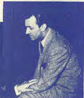
ND JOHN NEWLAND STAR IN "SCHLITZ PLAYHOUSE" APRIL 24