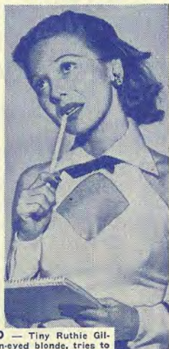
PUZZLED — Tiny Ruthie Gilbert, brown-eyed blonde, tries to figure out some puzzling dictation from her boss, Milton Berle, in her role of Maxine "Maxie," on Tuesday nights on the NBC-TV "Texaco Star Theatre."

5 M-WIRED WOODSHED 5 TWTF-HEADLINES 12:45 4 GUIDING LIGHT 8 Same 5 H'WOOD MATINEE 6 M-VOICE OF R.I.T. 6 TUE- CROSS TALK 6 W- ART GALLERY 6 TH-HOW YOU DO IT 6 F -MAKE IT, MARKET 1:00 4 MATINEE PLAYHOUSE 6 MTWT-MID-DAY 6 F - BETTY FURNESS 8 TUE-FASHIONS 8 MWTF - ED BROWN 1:15 6 M-YOU & YOUR CHILD 6 F-MIDDAY, MIDWAY 6 TH - TRAVEEERS 1:30 6-8 GARRY MOORE 1:45 4 JOHNNY'S SHOW