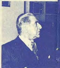
ROBERT WARWICK ANNOUNCES "ALLEN OF HARPER" ON TV

"They're forcing me to retire!" student John Newland in a dramatic on the "Schlitz Playhouse of Stars" (9:00-9:30 P.M., EST). Anne Seaman Rhys Williams complete a star-studded