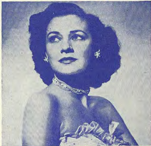
Lovely Jane Froman, beloved singing star, shops for new talent among the armed services with Alfredo Antonini and his orchestra on CBS-TV's "U.S.A. Canteen."