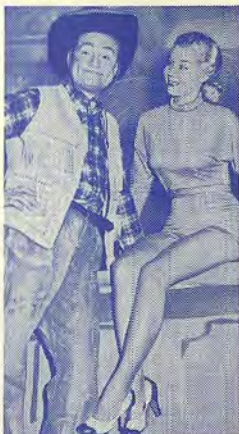
SEEING RED — The face under the sombrero belongs to Red Skelton, noted hero of old horse operas. The pretty one is Lucy Knoch.

5 M-WIRED WOODSHED 5 TWTF-HEADLINES 12:45 4 GUIDING LIGHT 8 Same 5 H'WOOD MATINEE 6 M-VOICE OF R.I.T. 6 TUE- CROSS TALK 6 W- ART GALLERY 6 TH-HOW YOU DO IT 6 F -MAKE IT, MARKET 1:00 4 MATINEE PLAYHOUSE 6 MTWT-MID-DAY 6 F - BETTY FURNESS 8 TUE-FASHIONS 1:00 8 MWF - ED BROWN 1:15 6 M-YOU & YOUR CHILD 6 F-MIDDAY, MIDWAY 6 TH - TRAVEEERS 1:30 6-8 GARRY MOORE 1:45 4 JOHNNY'S SHOW