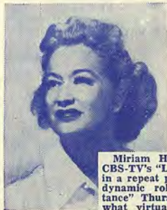
Miriam Hopkins returns to CBS-TV's "Lux Video Theatre" in a repeat performance of her dynamic role in "Long Distance" Thursday, April 23. In what virtually amounts to a one-woman "dramathon," Miss Hopkins plays a frenzied wife whose husband is about to die in the electric chair.