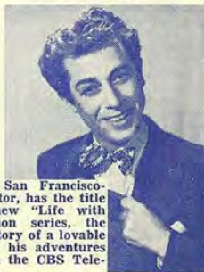
Vito Scotti, San Francisco-born Italian actor, has the title role in the new "Life with Luigi" television series, the warmhearted story of a lovable immigrant and his adventures in America, on the CBS Television Network.