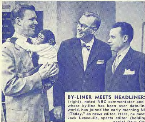
BY-LINER MEETS HEADLINERS — Merrill "Red" Mueller (right), noted NBC commentator and former foreign correspondent whose by-line has been over date-lines from most corners of the world, has joined the early morning NBC-TV news and feature show, "Today," as news editor. Here, he meets "Today's" other headlines: Jack Lescoulie, sports editor (holding "Mr. J. Fred Muggs"), and genial Dave Garroway.

GEORGE BRENT AND ANDREA KING IN "MEDICINE WOMAN" ON "SCHLITZ PLAYHOUSE OF STARS" MAY 1