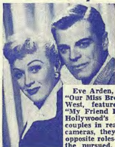
Eve Arden, star of CBS-TV's "Our Miss Brooks," and Brooks West, featured on CBS-TV's "My Friend Irma," are one of Hollywood's happiest married couples in real life. Before the cameras, they play completely opposite roles—the pursuer and the pursued, respectively—in affairs of the heart.