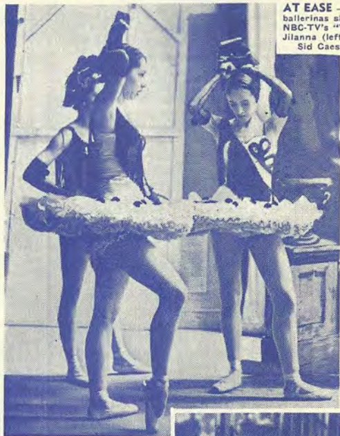
AT EASE — Even ballerinas show their nerves on NBC-TV's "Your Name in Lights" with Jilanna (left) and Sid Caesar.