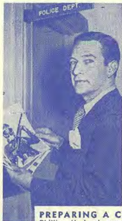
PREPARING A CASE — Phillips H. Lord, creator-writer-narrator of "Gangbusters," dramatic series based on files from police and other authorities, examines pictures in a case he is planning to dramatize.

5 M-WIRED WOODSHED 5 TWTF-HEADLINES 12:45 4 GUIDING LIGHT 8 Same 5 H'WOOD MATINEE 6 M-VOICE OF R.I.T. 6 TUE- CROSS TALK 6 W- ART GALLERY 6 TH-HOW YOU DO IT 6 F -MAKE IT, MARKET 1:00 4 MATINEE PLAYHOUSE 6 MTWT-MID-DAY 6 F - BETTY FURNESS 8 TUE-FASHIONS 1:00 8 MWTF - ED BROWN 1:15 6 M-YOU & YOUR CHILD 6 F-MIDDAY, MIDWAY 6 TH - TRAVELERS 1:30 6-8 GARRY MOORE 1:45 4 JOHNNY'S SHOW