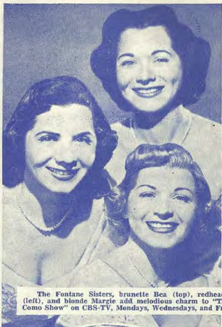
The Fontane Sisters, brunette Bea (top), redheaded Geri (left), and blonde Margie add melodious charm to "The Perry Como Show" on CBS-TV, Mondays, Wednesdays, and Fridays.

Dave Garroway, the genial fellow "with the off-beat approach," is spotlighted on "Today," NBC-TV's Monday-through-Friday morning programs of news, special events and entertainment. He also stars on his own NBC radio show.