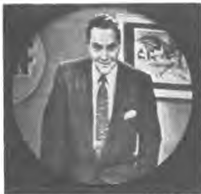
Entry submitted by W. Sampson, Pittsford, New York. Taken with a Kodak Signet, 1/25 second at f:4 on Super XX film.

After this contest is finished this magazine will still welcome pictures taken by viewers. Readers having their pictures published will win one year's subscription to TV Life.