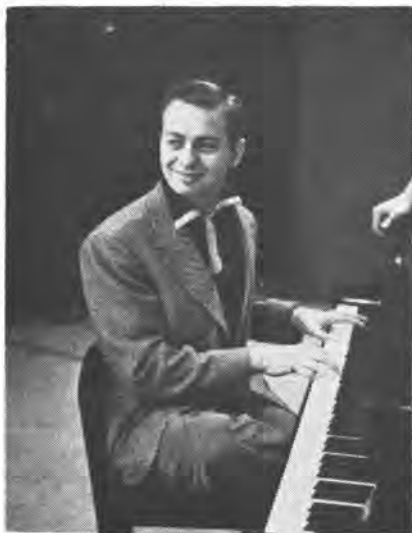
MEL TORME , singing idol and star of CBS-TV's "Mel Torme Show," is also talented as a pianist, drummer, songwriter, actor and orchestrator.