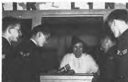
While at Sampson Air Base, the red-headed beauty took a turn at the Airlines ticket office. We'll wager ticket sales doubled during her brief stay.