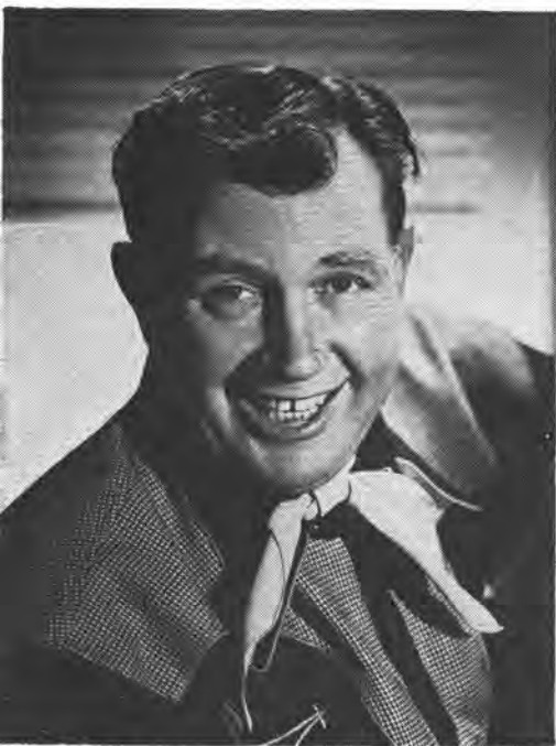
After 25 years of making motion pictures, Andy Devine has found a brand new audience as "Wild Bill Hickok's sidekick.

The rotund actor's youth was wild and wooly enough to match his TV role. He was born in Flagstaff, Arizona. His grandfather helped found the United States Naval Academy and his father owned a hotel in Flagstaff. One of the thrills of Andy's youth was carrying the first U.S. flag with forty-eight stars, the day Arizona was admitted as the last state in the union.