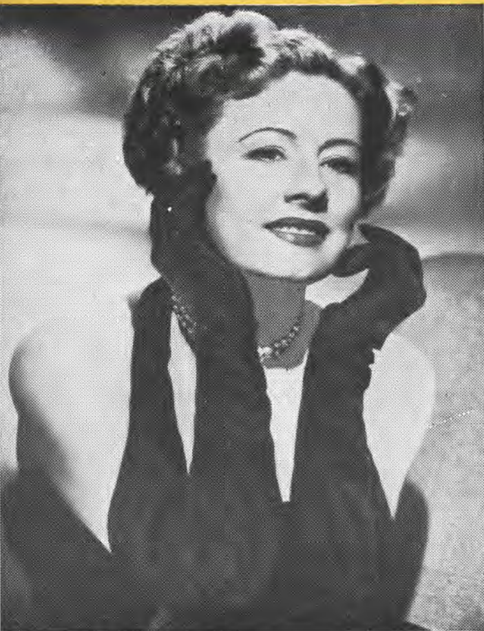
IRENE DUNNE, of Movie Fame, and now a regular on "Stars Playhouse"

Now Combined With ROCHESTER WHIRL MAGAZINE