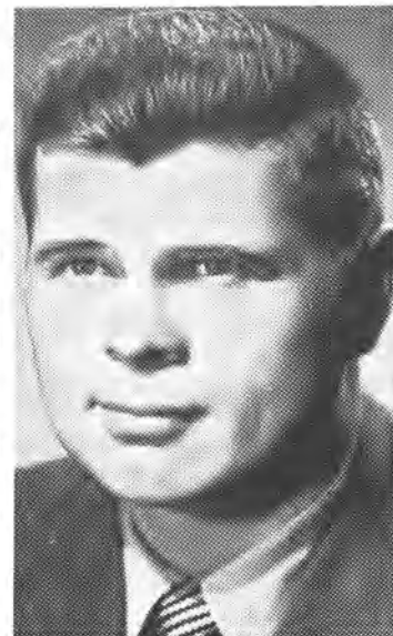
Barry Nelson has the starring role of Bat Adams, adventurer, in "The Hunter," new weekly dramatic series which is summer replacement for CBS-TV's "Man Against Crime."