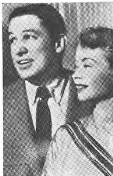
Mike Wallace and his actress-wife Buff Cobb, stars of CBS-TV's "Mike and Buff."