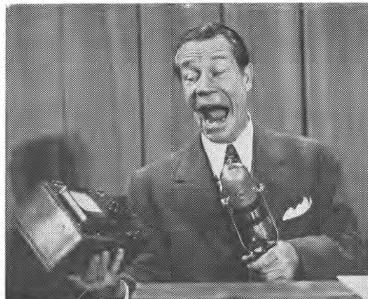
The "Talent Scouts" audience-reaction indicator registers a zillion decibels to comedian Joe E. Brown's wide-mouthed announcement that he will again take the helm when Arthur Godfrey vacations in August. Brown will emcee the "Arthur Godfrey's Talent Scouts" simulcasts on Mondays, Aug. 4-11-18-25 at 8:30 p.m. over CBS and CBS-TV. (Radio repeat 11:30 p.m.)