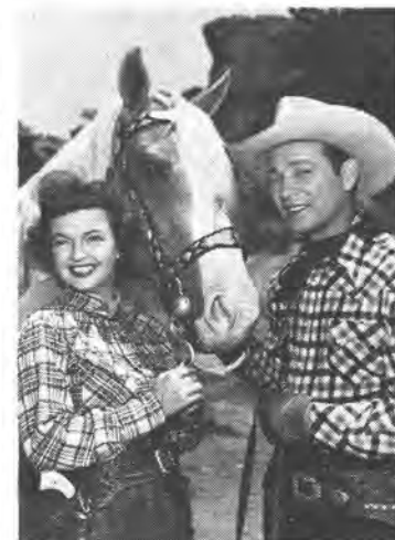
Roy Rogers, "King of the Cowboys," enjoys a vacation in the open country with his co-star, Dale Evans, "Queen of the West," and "Trigger," the famous palomino. They appear regularly in adventures on the "Roy Rogers Show," which resumes on N3C radio Aug. 28 and NBC-TV Aug. 31.