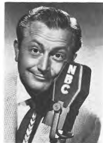
Movie star Robert Young returns to his role as head of the Anderson family in the situation comedy program, "Father Knows Best," on NBC radio, Aug. 28. Young portrays harried Jim Anderson, whose wife tries to prove to their children that "Father Knows Best."