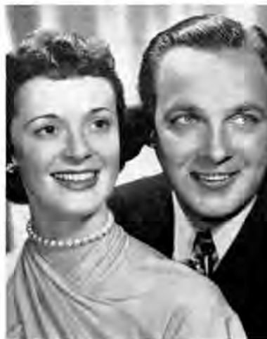
Giselle MacKenzie and Bob Crosby

augurated a career that brought him great fame... Arturo Toscanini observed his 86th birthday in New York recently by conducting two rehearsals, first, the Robert Shaw Chorale for two hours in the afternoon and then a symphony orchestra from 5 to 7:30 p. m., at Carnegie Hall... Up at Decca Records they reported that the Mills Brothers' waxing of "Half As Much" has sold over 250,000 discs, while the Four Aces totaled 200,000 sales for